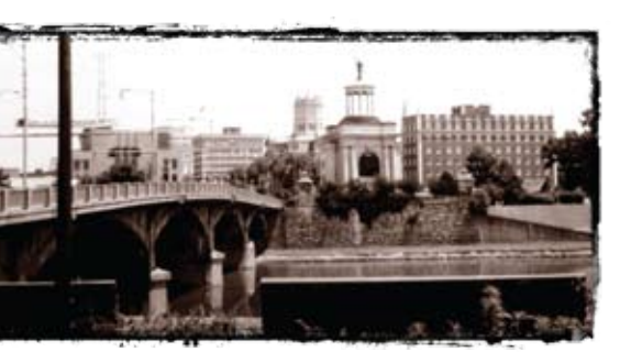
Original historic 1915 High-Main Street Bridge.

High-Main Street Bridge over the Great Miami River in Ohio features five-span, haunched replacement bridge to replicate original arch