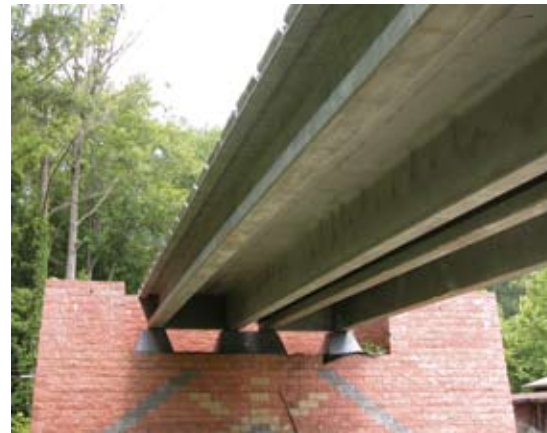
Ultra-high performance concrete, as used in this test bridge for FHWA, is a new material for bridge construction.

This is a 4-year program for promoting, demonstrating, evaluating, and documenting the application of innovative designs, materials, and construction methods in the construction, repair, and rehabilitation of bridges and other highway structures. One component of the program is dedicated to research, deployment, and education of technology related to high performance concrete bridges. FHWA has developed the HPC plan in response to the needs identified by members of AASHTO, TRB committees, NCHRP, industry, academia, and others. Details of the HPC program are posted on the FHWA website. A major part of the IBRD program is to provide funds to the state and local highway agencies for incorporating innovations into construction projects for improved safety, reduced congestion, and greater durability. Annual solicitation of applications is issued for proposed projects that meet the goals of the program. FHWA will make its funding determinations through a merit-based selection process. For more details of this program, visit http://www.fhwa.dot.gov/bridge .