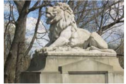
Concrete lions stand guard over the Taft Bridge.

Concrete is strong in compression but weak in tension. The true potentials of concrete were not realized until the industrial revolution in the 1800s, when structural steels were produced and readily available in large quantities and portland cement was produced in significant amounts in the United States. Ernest Ransome of California received a patent in 1884 for his invention of a twisted reinforcing steel bar. Ransome went on to design and build the first reinforced concrete bridge in the United States in 1884. The bridge is known as the Alvord Lake Bridge in Golden Gate Park, San Francisco, California. The bridge is still in service. The successful use of reinforced concrete in the Alvord Lake Bridge has led to the construction of many reinforced concrete arch bridges in other parks around the country. Robert Maillart and Eugene Freyssinet have been credited as the pioneers and champions in