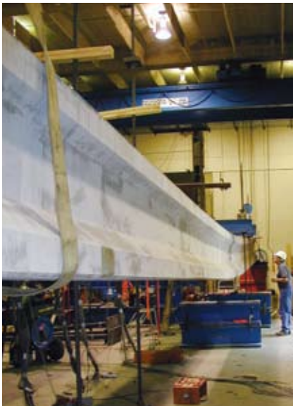
Flexural test of ultra-high performance concrete beam.

The American Concrete Institute defines concrete durability as the ability of concrete to resist weathering action, chemical attack, abrasion, and other conditions of service. Specifically, concrete must be designed, proportioned, mixed, transported, placed, and cured properly to assure its resistance to potential freeze-thaw damage, alkali-silica reactivity, sulfate attack, chloride penetration, corrosion of reinforcing steel, abrasion, and load effects. The development of high-performance concrete (HPC) is aimed at achieving durable concrete.