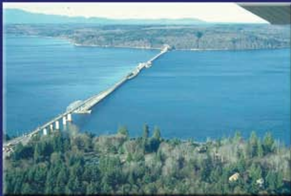
Hood Canal Floating Bridge, Seattle, Washington