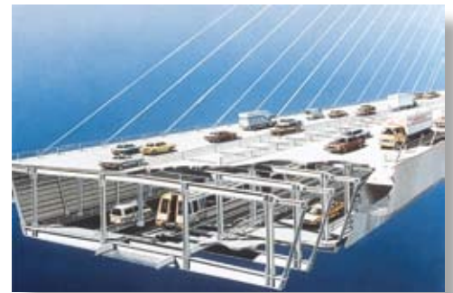
The cable-stayed Kap Shui Mun Bridge in Hong Kong, China, is part of the crossing to the Hong Kong International Airport. The side spans use post-tensioned concrete box girders that were incrementally launched into their final position.

The adjoining viaduct structure is approximately 1630 ft long and consists of twin six-span, cast-in-place on falsework, multi-cell, concrete box girders, with span lengths of 240 to 285 ft. The traffic arrangement replicates the format for the main bridge. The viaduct's