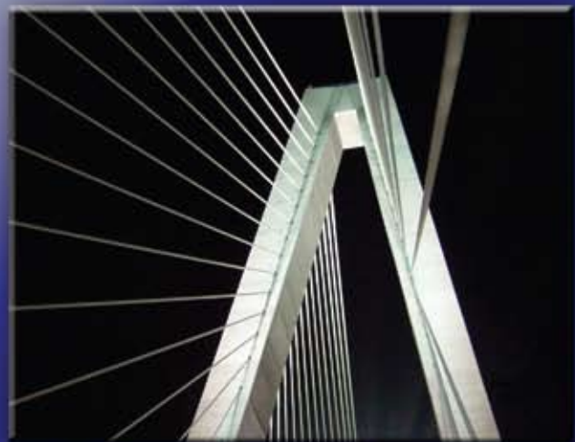
Arthur Ravenel Jr. (Cooper River) Cable-Stayed Bridge, Charleston, South Carolina