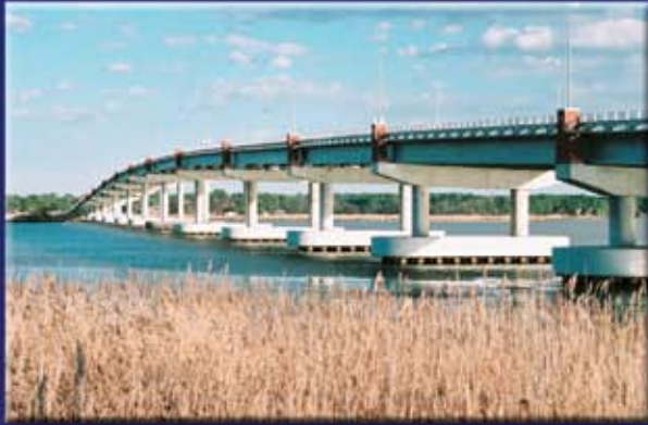
Mattaponi River Spliced Girder Bridge, West Point, Virginia