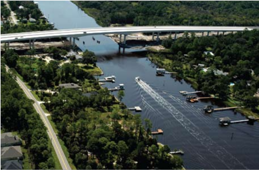
The Palm Valley Bridge over the St. John River in Florida uses spliced, post-tensioned concrete I-girders for the main span of 290 ft.