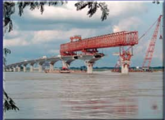
Lalon Shah Precast Segmental Bridge, Bangladesh