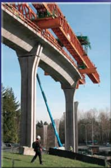
Sound Transit Guideway Structure, Seattle, Washington