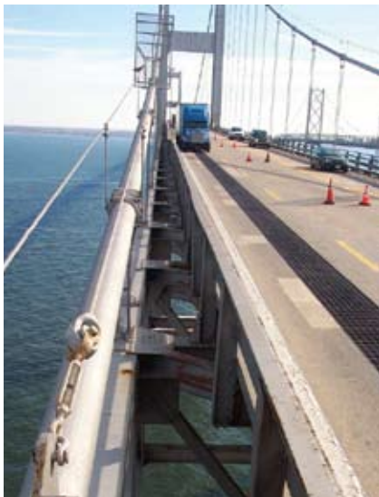
Precast concrete deck panels are being used to replace the deck on the Chesapeake Bay Bridge.

'Some owners have very clear standards for what they want, while others rely on our expertise.'