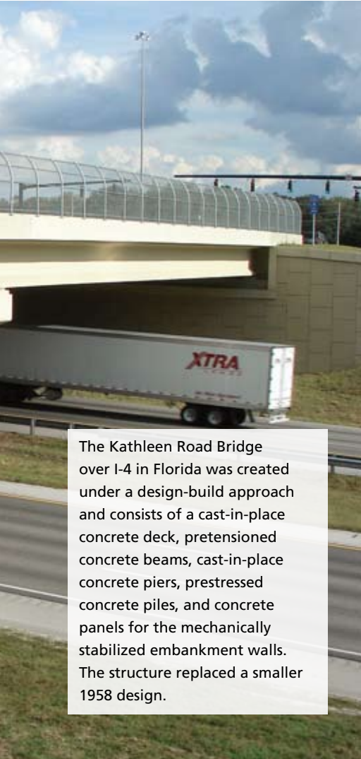
The Kathleen Road Bridge over I-4 in Florida was created under a design-build approach and consists of a cast-in-place concrete deck, pretensioned concrete beams, cast-in-place concrete piers, prestressed concrete piles, and concrete panels for the mechanically stabilized embankment walls. The structure replaced a smaller 1958 design.