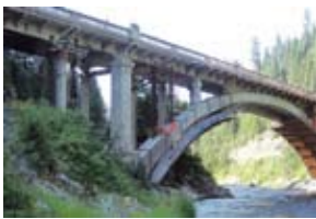
CH2M HILL's recent preservation of the historic Rainbow Bridge in Idaho was recognized as the International Concrete Repair Institute's 2007 Project of the Year.

High above the Carquinez Strait, the new Benicia-Martinez Bridge now carries five lanes of northbound traffic, significantly reducing daily traffic congestion for the 100,000 vehicles using I-680. CH2M HILL, in a joint venture with TY Lin International, used lightweight concrete and a cast-in-place method in constructing the 1.6-mile-long bridge.