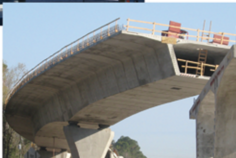
I-95 / I-295 Bridge