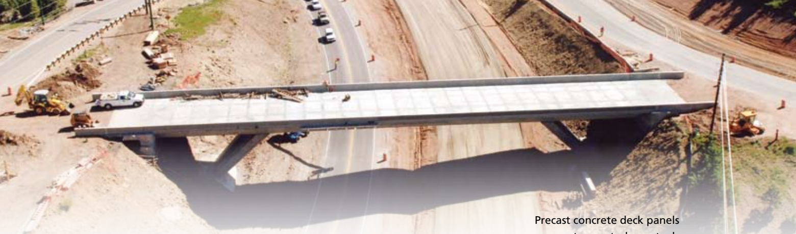
Precast concrete deck panels were set over studs on steel plates embedded in the girders.