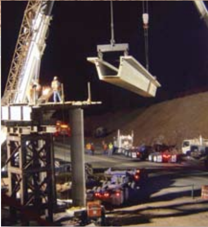
Six prestressed, post-tensioned trapezoidal U-girders, 60 in. deep, were used for the superstructure.

Prior to beginning construction, design engineers created a virtual 3-D model, while the contractor built a full-scale mock-up of the pier leg-to-girder connections. These are both unusual steps for a modest project. Because this project was far from typical, the