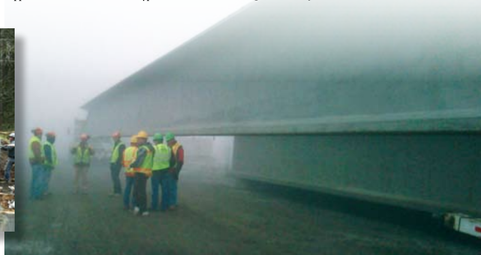
River Road Bridge is a 183-ft-long single span bridge that uses 84-in.-deep bulb tees supporting a cast-in-place concrete deck. The deck bulb tees are the longest in Oregon.