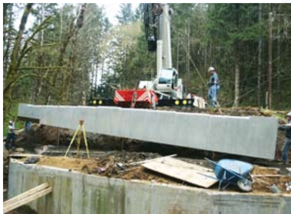
Greener Road Bridge used precast concrete pile caps to speed construction.

Jim Perkins is a structural engineer with Washington County, Ore.