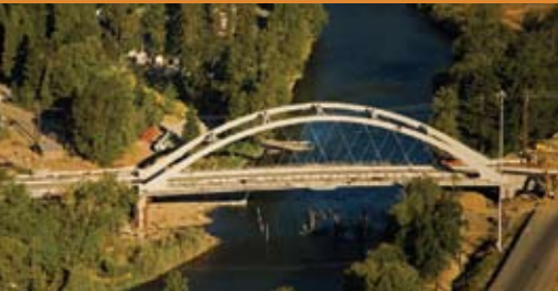
Rogue River (Depot Street) Bridge Replacement Jackson County, Oregon 2008 ACEC Oregon Project of the Year

Core Purpose: To improve the quality of life while demonstrating stewardship of the built and natural environments.