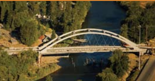
Rogue River (Depot Street) Bridge Replacement Jackson County, Oregon 2008 ACEC Oregon Project of the Year

Core Purpose: To improve the quality of life while demonstrating stewardship of the built and natural environments.