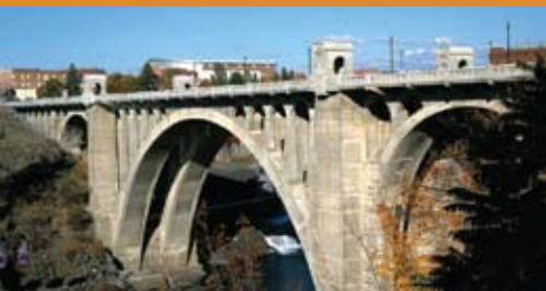
Monroe Street Bridge Rehabilitation Spokane, Washington 2006 Gold Award, Engineering Excellence, ACEC Washington

At DEA, our approach to bridge projects begins with people: clients, communities, and the needs of future generations. We study community concerns, site opportunities, and design and construction issues before beginning the design process. The results are designs tailored to the communities they serve today and tomorrow.