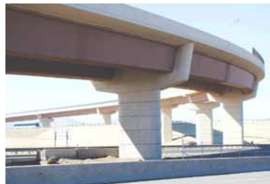
Integral pier caps on all fixed interior piers resolved clearance issues and presented a lighter, consistent visual appearance.

2115-FT-LONG PRECAST CONCRETE FLYOVER RAMP WITH MODIFIED CDOT U84 CURVED GIRDERS / COLORADO DEPARTMENT OF TRANSPORTATION, OWNER