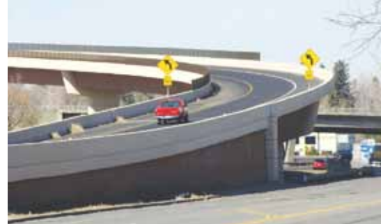
The 11-span bridge, which crosses Clear Creek, a bike path, and three traffic openings, plus eastbound and westbound I-70, and eastbound SH58, features a circular curve with a radius of 809-ft that transitions through a spiral curve to a tangent section.