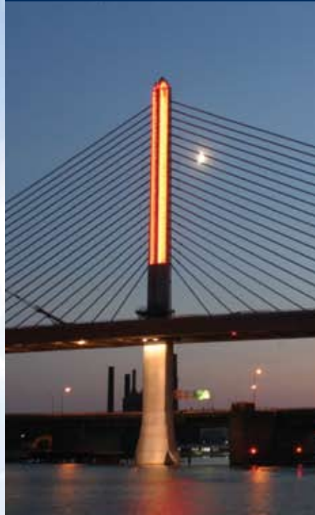
I-280 Veterans' Glass City Skyway, Ohio