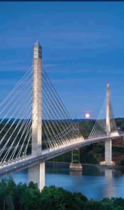
Penobscot Narrows Bridge & Observatory, Maine