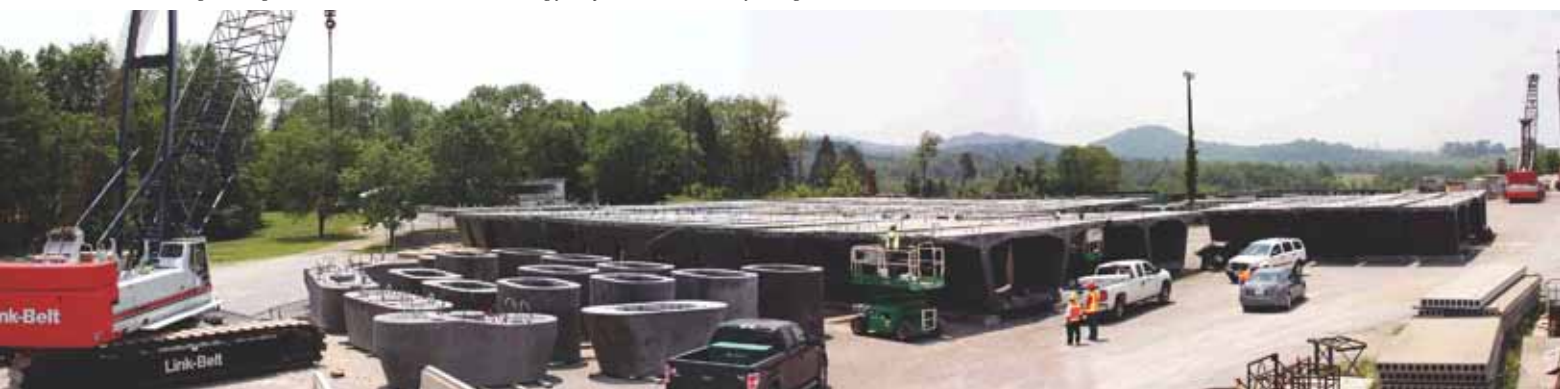
Column and girder segments are shown stored in the casting yard for Foothills Parkway Bridge No. 2 in Tennessee.