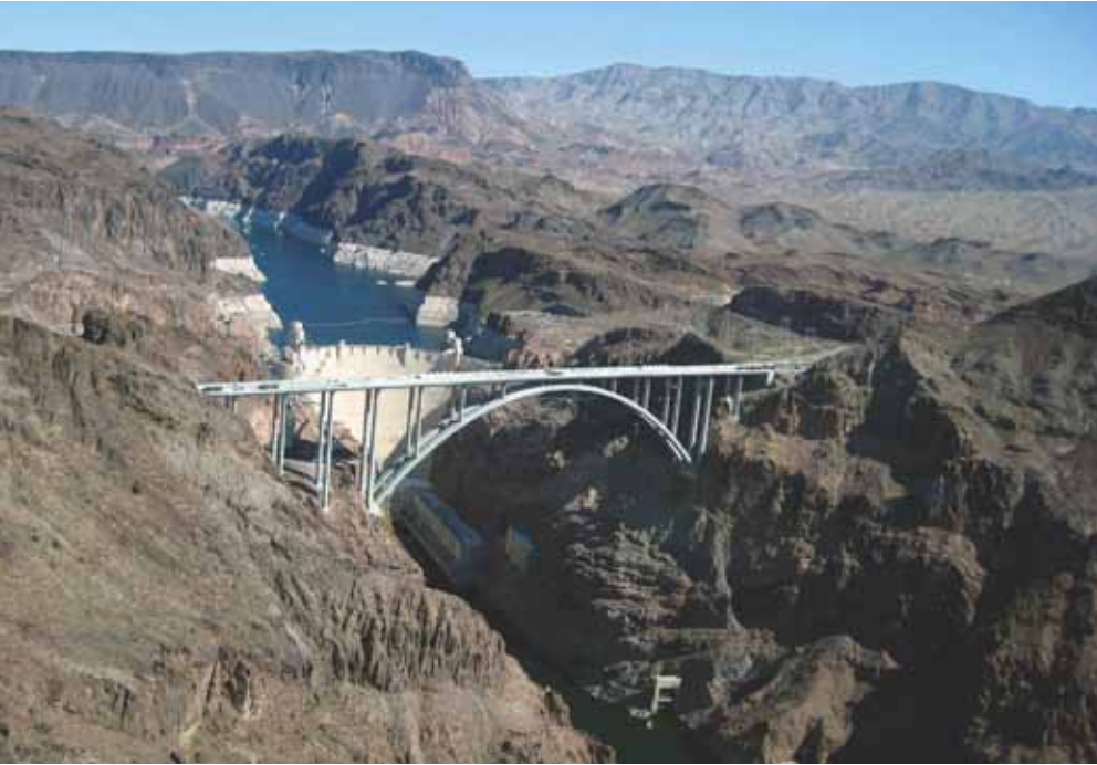
The Mike O'Callaghan–Pat Tillman Memorial Bridge over the Colorado River at Hoover Dam.

T he Office of Federal Lands Highway (FLH) provides program stewardship and transportation engineering services for planning, design, construction, and rehabilitation of the highways and bridges that provide access to and through federally owned lands. The federal government has title to about 650 million acres—roughly 30% of the total area of the United States. There are more than 300,000 miles of federally owned roads.