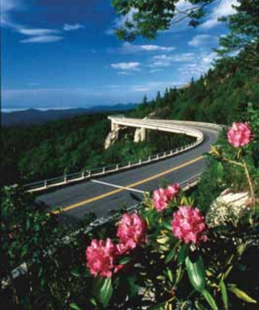
Blue Ridge Parkway or Linn Cove Viaduct in North Carolina. Work began on the viaduct in June 1979 and was completed in November 1982 at a final cost of $9.8 million.