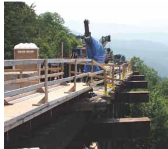
On the project site, a temporary trestle is in place as work gets started on Foothills Parkway Bridge No. 2.