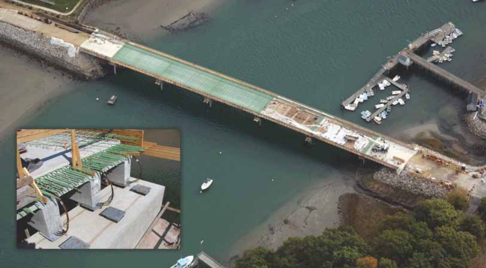
The new Route 103 Bridge over York River in York, Maine, features two 55-ft-long end spans and five 80-ft-long interior spans that use four 36-in.-deep Northeast Extreme Tee (NEXT) beams. The bridge provides the first use of this new girder design, which has wider stems to support higher design loads.

Vt., the state's first major design-build transportation project. The project used only local funding—$16 million worth—to create a three-span, 480-ft-long bridge consisting of precast concrete girders. The 240-ft main span, the longest precast, post-tensioned, simple span, spliced concrete girders in the country, eliminated the need for any piers near Otter Creek.