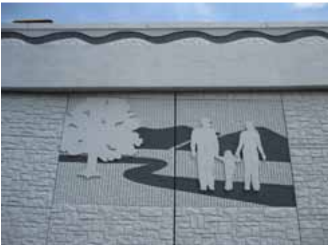
Custom formliners used along parapets and walls.

The bridge width accommodates two through lanes in each direction, a 32-ft-wide area for turn movements, a 5-ft 6-in.-wide bike lane in each direction, a 7-ft 6-in.-wide sidewalk in each direction, and approach ramp geometry.