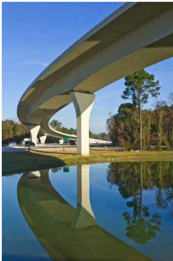
The bridge was completed in September 2010. Variable depth segments were used to increase the span lengths while minimizing materials.