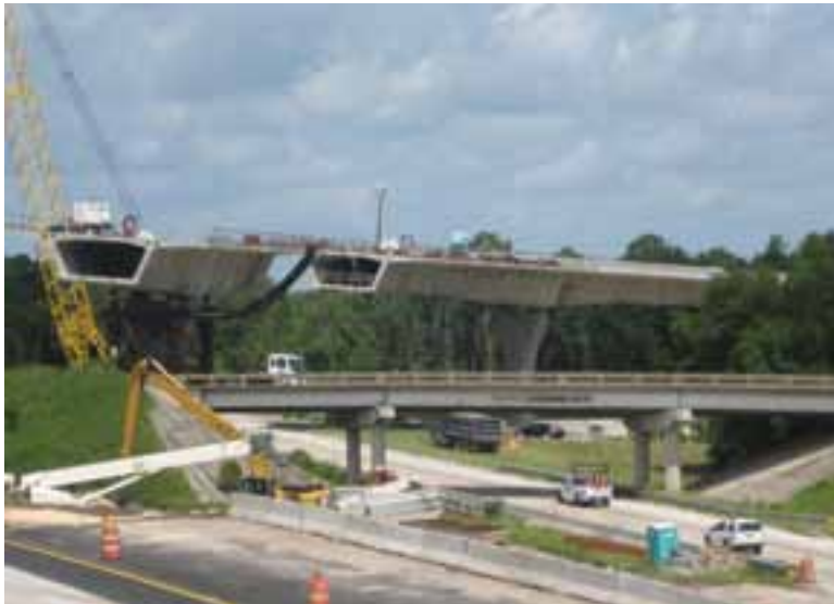
The third-level flyover bridge will take traffic over the existing interstate and exit ramps.

This rendering of a longitudinal section through the box girder shows the temporary erection bars located above the bottom slab that were kept external in the variable depth portions near the piers to reduce potential spalling in the bottom slab. Rendering: Parsons Brinckerhoff.