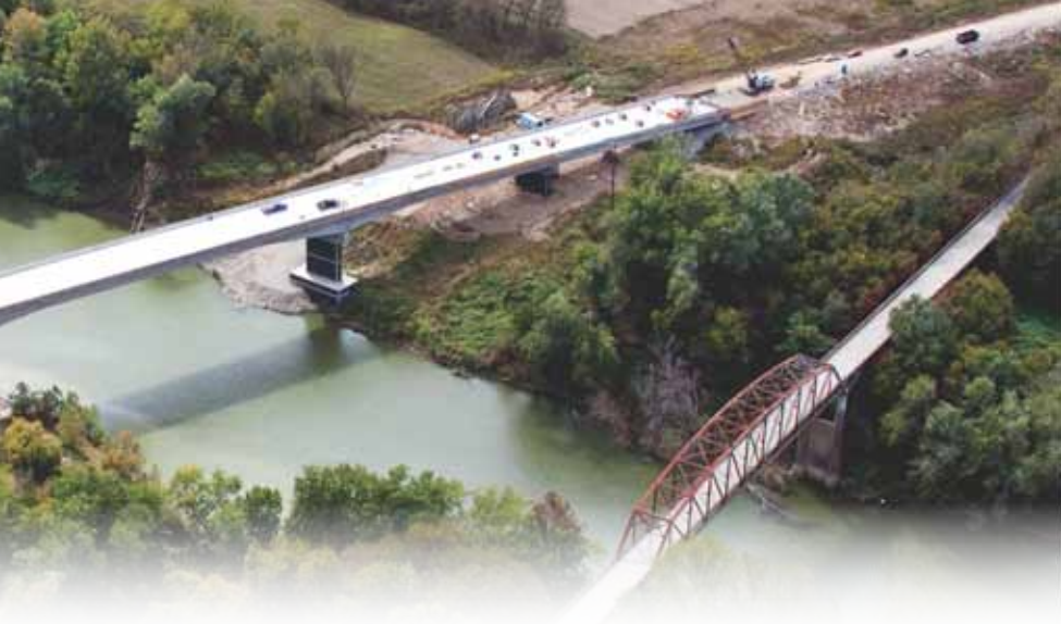
Left: The new spliced precast, prestressed concrete girder bridge along Route 22 over the Kentucky River replaces a deteriorated steel structure that will be demolished once construction is completed.