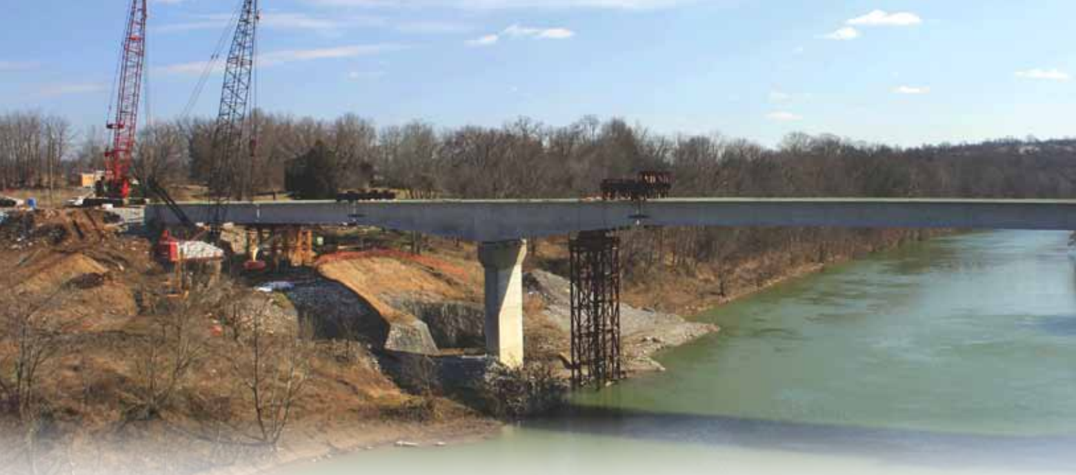
The new structure features a four-span concrete design that includes a 325-ft main span, the longest span for a precast girder bridge in the United States. The main span and east approach span are shown.