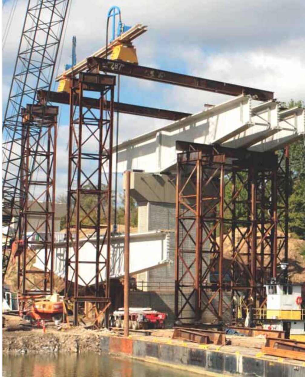
Temporary towers supported steel beams spanning over the piers that in turn supported a gantry with strand jacks to lift the pier segments and move them laterally into place. Photo: Haydon Bridge Co.

Falsework towers under the pier segments provided temporary support of the cantilevers during this operation. Photo: Haydon Bridge Co.