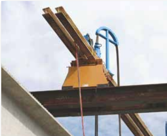
A strand jack was used to lift haunched pier segments from the barge to the pier seats. The jacks were later relocated and used to lift the drop-in girders for the main span.