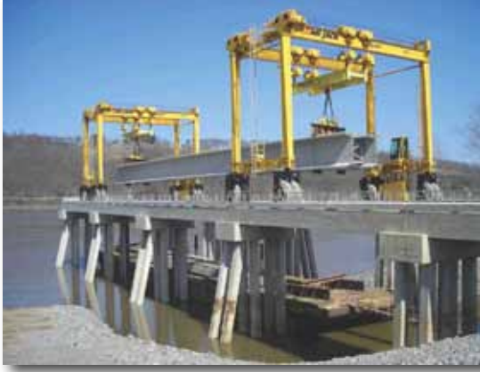
Above: The precaster's loading pier allowed the heavy precast girders to be placed on specially designed barges, which delivered the components to the site. The 185-ft-long main-span, drop-in girders were always handled as braced pairs to address stability concerns.