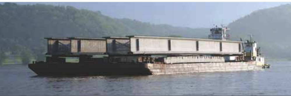
The girders were transported to the site on barges during high-water levels in the spring, after the precaster had modified and repaired several locks along the route.

Construction began with the end bents, piers, and temporary supports. Then the haunched pier segments were erected, followed by the main-span, drop-in segments. Once they were in place, the remaining girder segments were erected and the closures were cast.