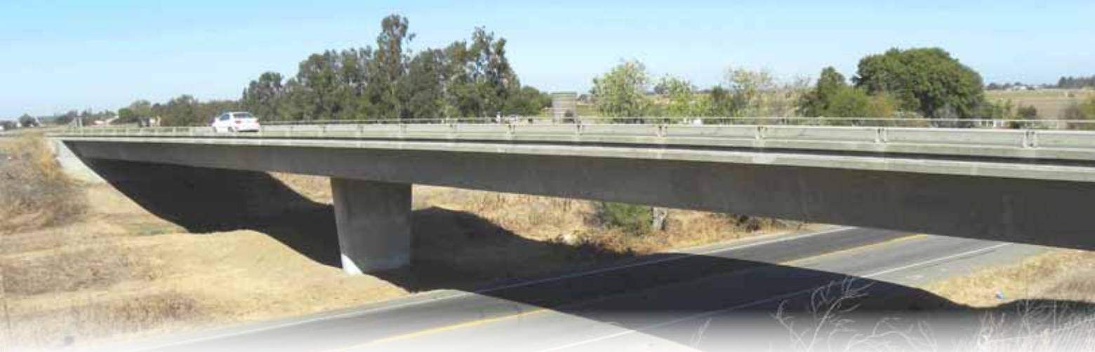
This California pilot bridge is located about 30 miles south of Sacramento.