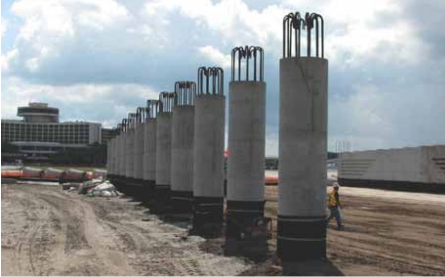
The main pier, integrally connected to the superstructure, consists of 48-in.-diameter columns, supported by 48-in.-diameter drilled shafts.

The bridge was designed to be constructed in three phases, with two construction joints running longitudinally down the bridge. The center phase was constructed first, followed by the two adjacent phases.