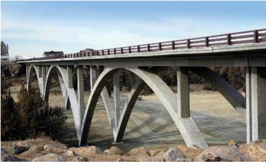
The Maple Avenue Bridge in Redmond, Ore., features cast-in-place concrete arches consisting of two side-by-side ribs fixed at the base while pinned to and continuous across the intermediate footings.

three-span, cable-stayed section with fanned stays. The main span features partial-depth precast concrete deck panels with cast-in-place composite topping for a maximum thickness of 1 ft 2¼ in., post-tensioned with adjacent cast-in-place concrete spans. (For more on this project, see the Spring 2012 issue of ASPIRE .)