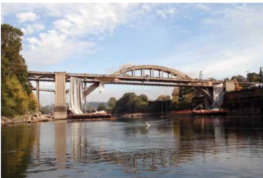
A complex rehabilitation project of the Oregon City Arch Bridge used an innovative, custom shotcrete mix specifically designed to adhere to the existing steel.

For additional photographs or information on this or other projects, visit www.aspirebridge.org and open Current Issue.