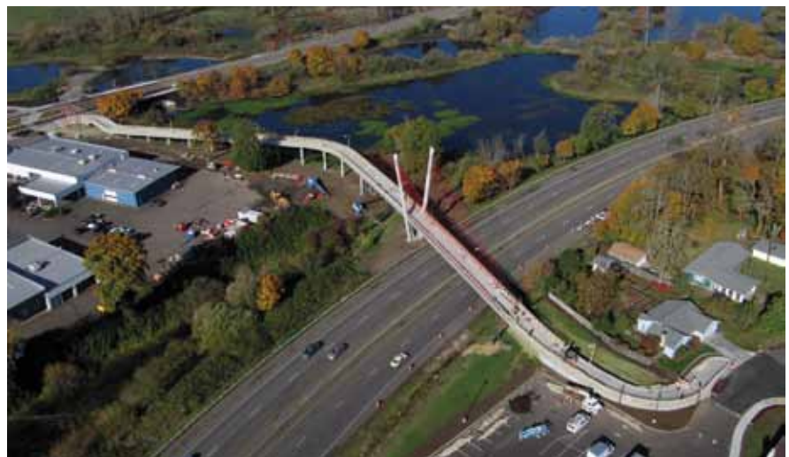
The 760-ft-long Delta Ponds Pedestrian Bridge in Eugene, Ore., features a 340-ft-long, asymmetrical, three-span, cable-stayed section with fanned stays.

The firm produces a variety of styles of pedestrian bridges, including signature cable-stayed designs. The Delta Ponds Pedestrian Bridge in Eugene, Ore., for instance, is a 760-ft-long concrete bridge with a 340-ft-long, asymmetrical,