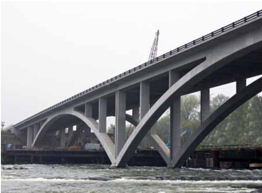
The I-5 twin arch bridges in Eugene, Ore., now under construction, are the largest concrete arch spans to be built in the state.

in part to address regulatory and client goals for minimal impacts at the environmentally sensitive site," says Fox.