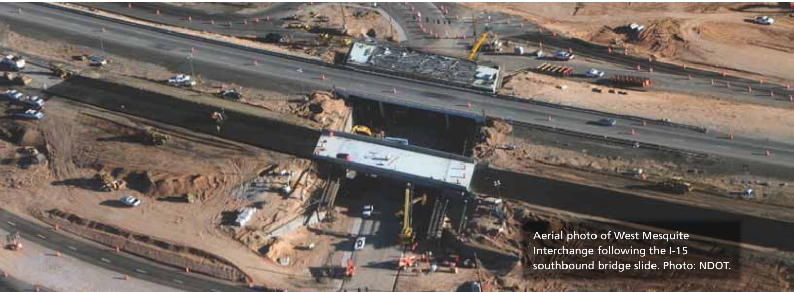
Aerial photo of West Mesquite Interchange following the I-15 southbound bridge slide.