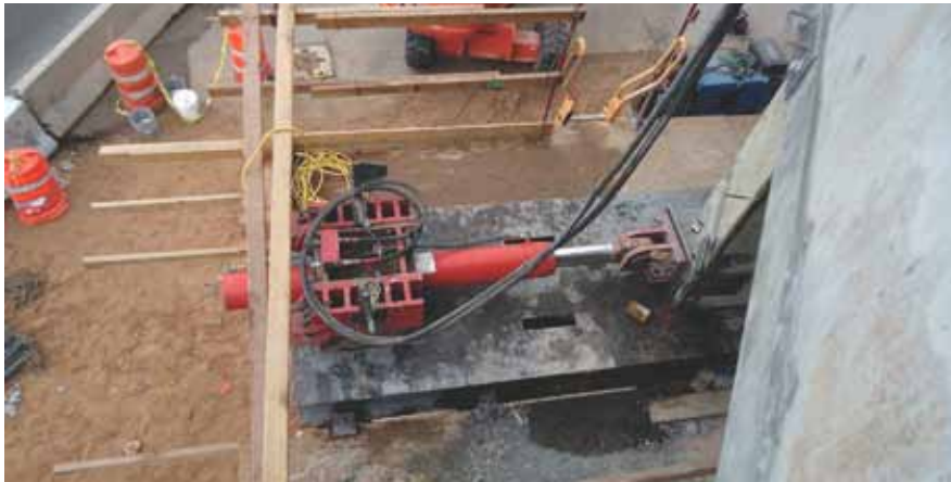
Top down view of the hydraulic jack pushing the bridge.