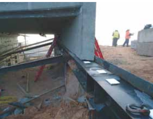
Teflon pads on rails assisted the sliding of the approach slab and bridge into place.