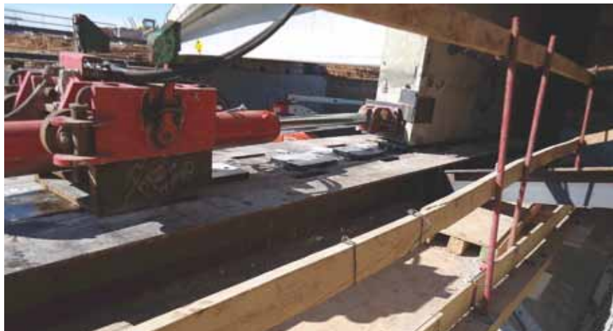
Side view of the hydraulic jack pushing the bridge.