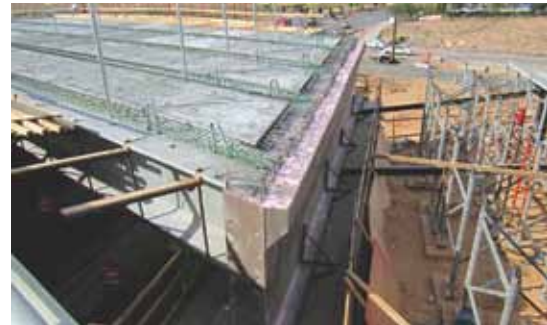
Construction of the southbound I-15 bridge deck happened directly adjacent to live I-15 traffic.

First, crews rerouted traffic on I-15 through the interchange on- and off-ramps that were temporarily widened to two lanes for the closure. Next, the existing bridge was demolished, which took about 12 hours. Crews then lifted