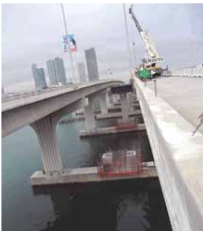
Another view of the Port of Miami Tunnel Project.

is indexed to a low rate for taxable debt. TIFIA can also be subordinate to the repayment of senior debt, such as bonds or bank loans in all cases except in bankruptcy of the P3.