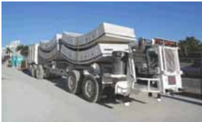
This truck hauls precast concrete tunnel-liner components.