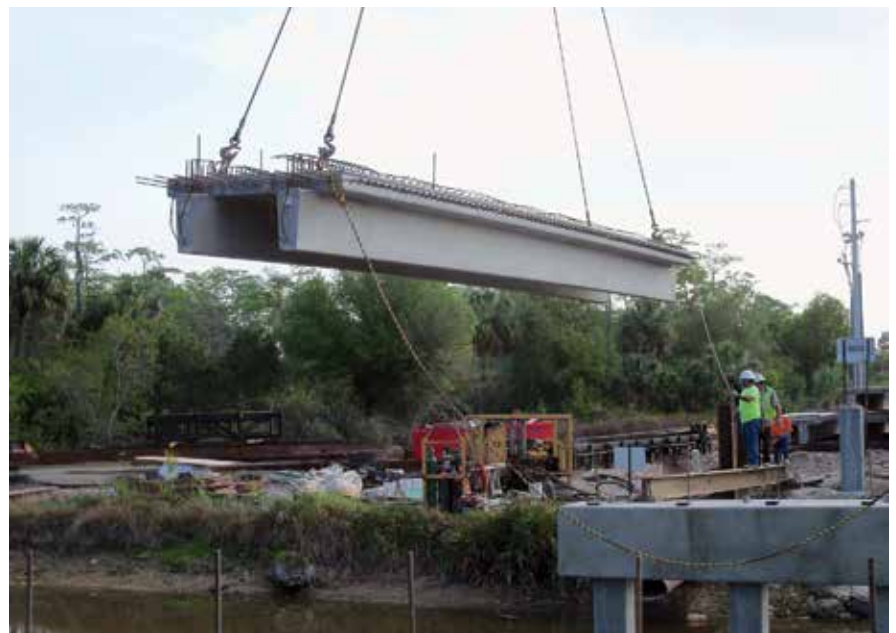
Florida double tee getting ready to be set.