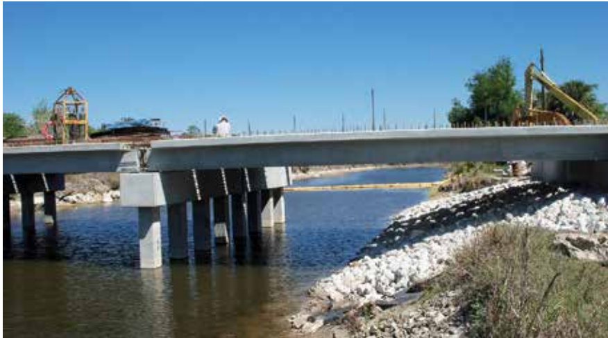
Profile view of bridge at the eastern end—looking north.

W hite Boulevard is a two-lane, undivided rural roadway located in a residential area in the northeast corner of the Golden Gate Estates Community in Collier County, Fla. The old four-span prestressed concrete slab bridge was built in 1965 and carries White Boulevard over the Golden Gate Main Canal. In recent years, the structure had fallen into disrepair. An independent condition assessment study was performed in 2008 and together with the Florida Department of Transportation (FDOT) biennial inspection report, the recommendation was that the bridge needed to be replaced.