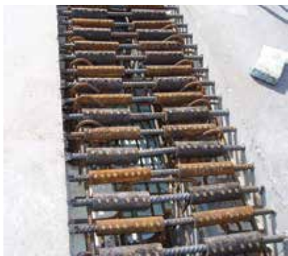
Mechanical couplers were used to connect continuity reinforcement over the interior supports.