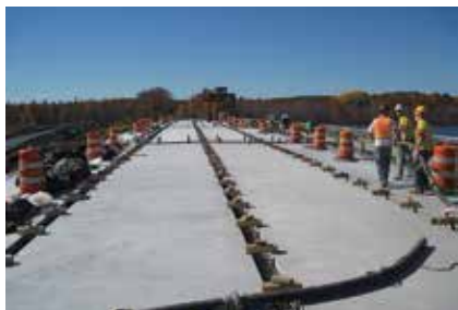
High-performance concrete was used in the longitudinal closure joints.

For live load negative moment continuity over the piers, mechanical couplers were detailed to field splice the splice bars between adjacent beams. This required the precaster to align the bars from adjacent beams to tight tolerances. For the positive moment continuity reinforcement in the bottom of the beams, which normally is provided by overlapping extended prestressing strands, a special detail was developed using a steel end plate with field welded ASTM A706 mild-steel reinforcement.