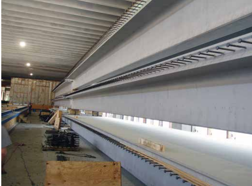
By using high-performance/high-strength self-consolidating concrete, the precaster was able to consistently achieve an outstanding quality surface finish without any noticeable imperfections.

Float-mounted erection equipment was not feasible due to the pond's shallow depth. The contractor determined that erecting the beams using a custom fabricated gantry crane was most cost effective. The gantry ran sideways from the old bridge onto the new piers to erect the beams instead of erecting the beams using two cranes supported on temporary pile platforms, as initially indicated during the technical proposal. The steel gantry crane rail support beam system was designed to span from the old bridge to, and along, the new piers. A typical beam erection sequence involved backing the 70-ton beams under the gantry crane.