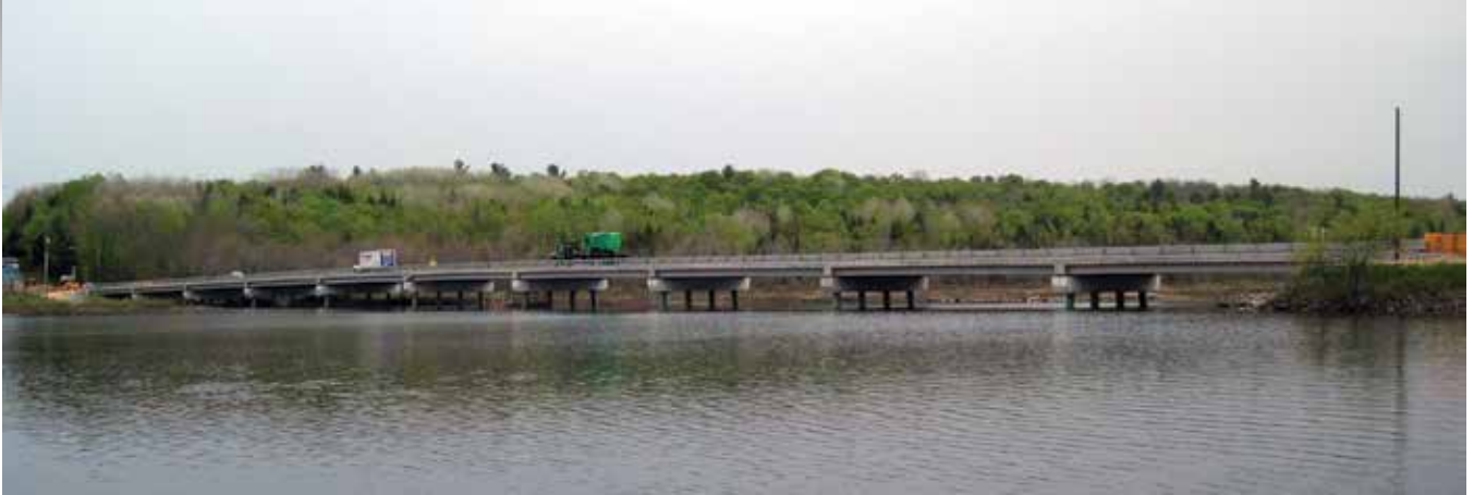
The 790-ft-long, two-lane bridge consists of ten 79-ft spans arranged in two 5-span continuous units spanning over a shallow pond.