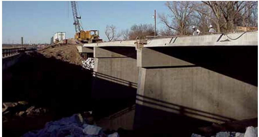
Typical inverted-tee bridge.

The IT system is designed to be especially efficient for construction by small contractors in sparsely populated areas. IT beams can be handled with the same equipment used for precast concrete pile handling. Installation of formwork for the overhang is the most time consuming part of the deck forming, and is typically left up to the contractor to decide on the best method of construction.