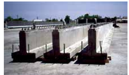
Typical inverted-tee in the casting yard.

the bottom flange width is the same for all beam depths. The web height is easily adjustable within the standardized design at 4 in. increments. Self-consolidating concrete makes this small and efficient shape relatively easy to cast. The only types of reinforcement used in the section are straight, ½-in.-diameter strands and WWR. The beams are relatively lightweight reducing some of the heavy lifting and transportation requirements typically associated with AASHTO or bulb-tee beams. The standardized element shape, with a range of beam heights and only two types of reinforcement—combined with high-quality concrete mix designs and fabrication specifications required by NDOR—provide a superior beam system for the bridges that is both efficient to manufacture and lightweight to install.