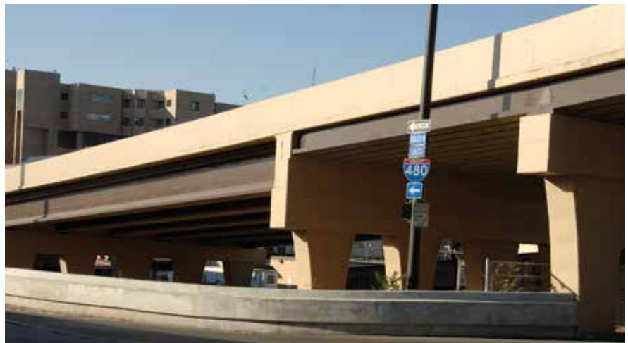
Inverted-tee and NU I-girder used on the same bridge in Omaha, Neb.