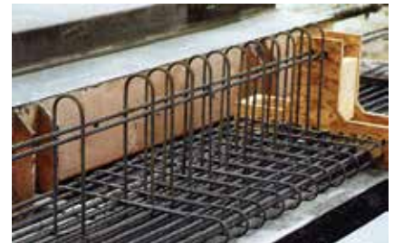
Reinforcement details of inverted-tee beam.

The two components of the concrete beam shape—bottom flange and web—are standardized such that