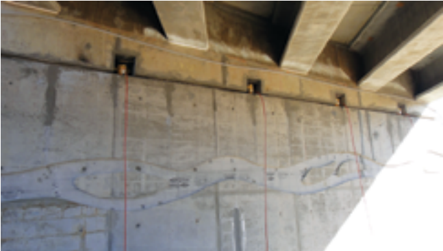
Jacking pockets in concrete end diaphragms are shown with the jacks.

plans and sequencing plans for closure periods for the road. Some departments of transportation have developed ABC specifications to cover additional requirements of the contractor or design-builder when utilizing ABC moving techniques. In some cases, these special provisions can become very specific. Too restrictive of an ABC specification can limit innovation during bidding.