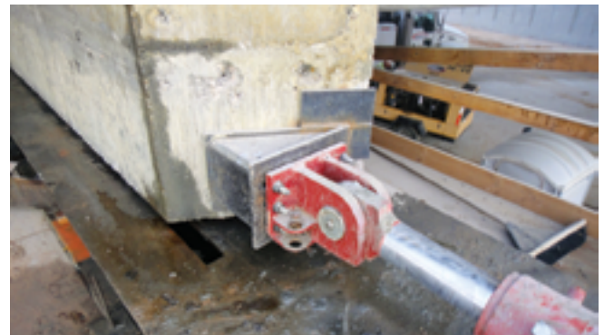
Push block between the hydraulic jack and the abutment must handle an axial load plus a horizontal shear without damaging the end of the diaphragm.

Coordination early and often with the bridge-move subcontractor is highly recommended.