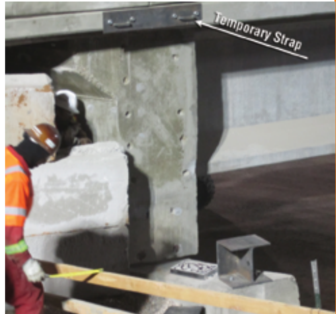
Temporary strap tying the approach slab to the bridge deck slab.

These adaptations need to be made at the design stage, as contractors must build the components to the plan dimensions to ensure the final bridge elevations match the required final profile. In some cases, when one abutment is out of line longitudinally, adjustments by the use of guide rails can be made to counteract anticipated and unanticipated movements in unguided systems.