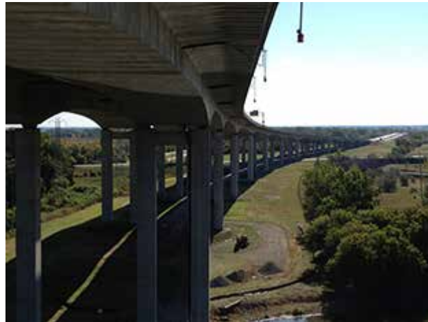
Expansion joint strongback configuration.