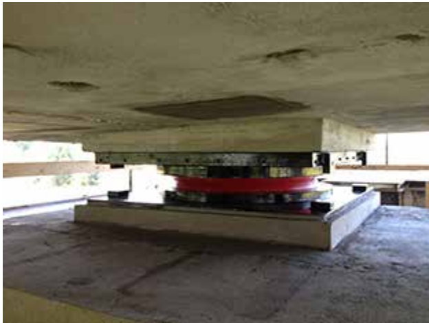
Completed pier bearing.