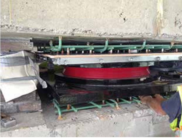
Installation of pier disk bearing.