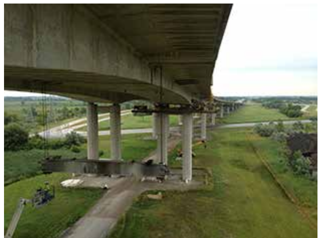
Hoisting of underslung beam at expansion joint.