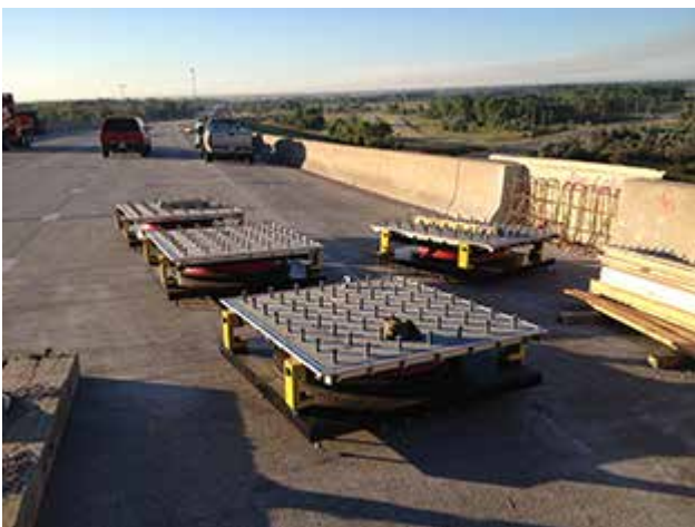
Pier disk bearings.