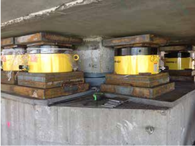
600-ton jack layout on pier column.