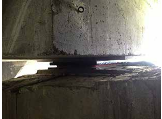
Newly installed expansion joint bearing.