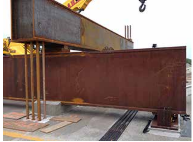
Expansion joint strongback configuration.