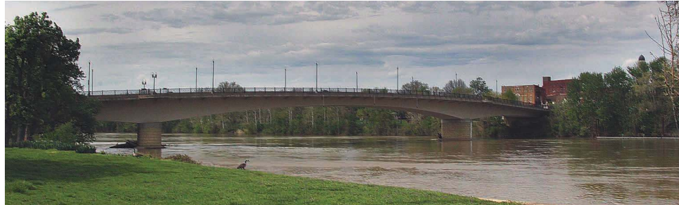
South elevation.

done by Kokosing Construction Company Inc. of Fredericktown, Ohio, and completed at a cost of over $8 million.