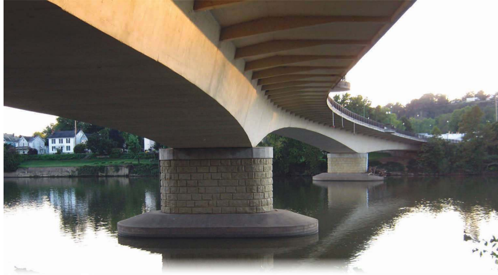
Putnam Bridge piers 1 and 2 south elevation.

Washington County is also home to the Putnam Bridge, Ohio's first cast-in-place concrete, segmental, box-girder bridge. The Putnam Bridge spans the Muskingum River, in the pioneer city of Marietta. Construction began in June 1998 and was completed in September of 2000, replacing a 1914 steel through-truss bridge. The original design was by HNTB of Cleveland, Ohio, with a value engineering re-design by Finley McNary Engineers Inc. of Tallahassee, Fla. Construction of the bridge was