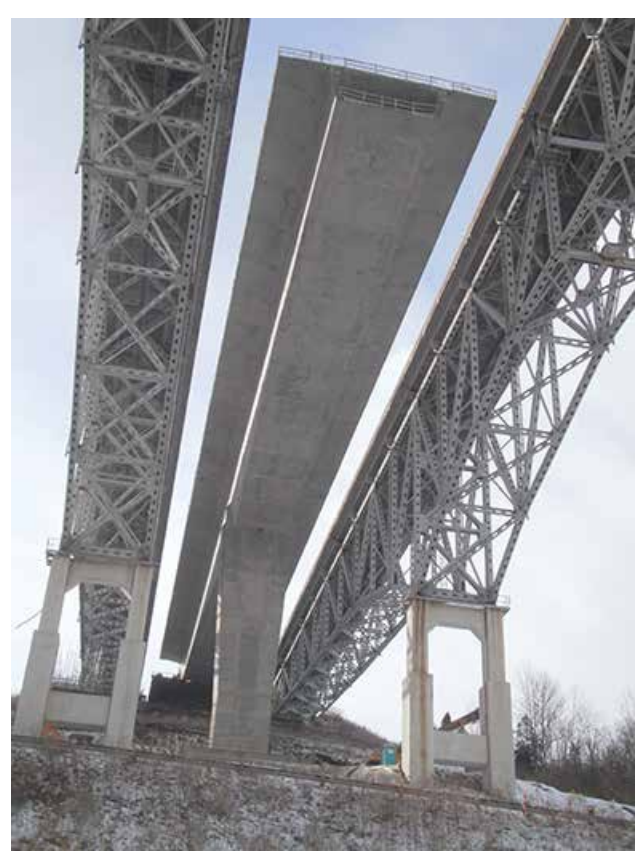
The southbound pier 1 completed cantilever shows the steep terrain conditions necessitating pier column clear heights ranging from 36 to 194 ft.