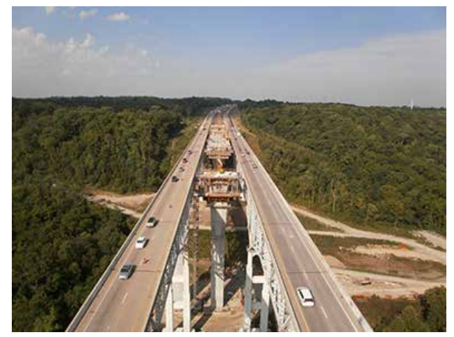
The first of the two new bridges was constructed between the two existing bridges. Traffic is maintained in both directions during all construction operations.