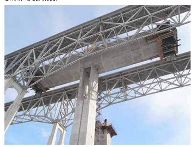
Acting as a fuse element, flexible 65-ft-tall twin-wall piers limit transmitted forces to the substructure below, and are designed to dissipate creep, shrinkage, and thermal effects while providing adequate capacity for external loads.