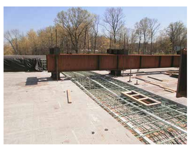
The closure strong-back beams were sized to accommodate forces associated with vertical alignment, and also were required to slide longitudinally during the horizontal jacking procedure while keeping the cantilever tips at the proper elevation.