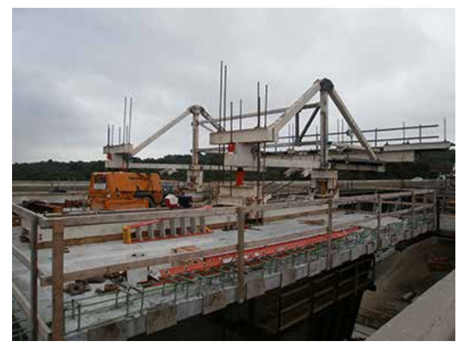
The box girder is cast without the use of scaffolding or falsework using overhead form travelers.