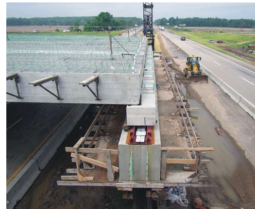
Temporary pier and span 1 beams in sliding track.

The fouling of the sliding bearings led to some damage and movement of the bearings during the slide. At one point the slide had to be reversed to remove a bearing that became lodged on top of an adjacent bearing after it broke the restraining pintle and slide on top of the adjacent bearing pad. Also during the sliding operation, the middle jack began to experience problems. Since breakout