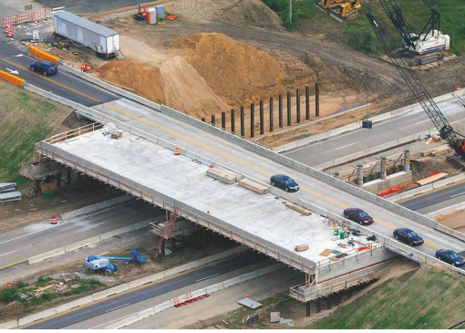
M-50 over I-96 traffic on new superstructure in temporary alignment.

Mich., is part of a complete interchange reconstruction project and represents the state's longest, heaviest, and most rapid bridge lateral slide to date. The project, which is the third lateral slide-in bridge for MDOT, was delivered using a construction manager/general contractor (CM/GC) method. MDOT's own design team produced the final structure design.