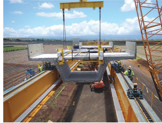
Precast concrete segments, 30 ft wide and weighing 36 tons, were cast in a facility that was approximately 5 miles away, then delivered to the site for erection on underslung girders.

The 11-ft length of the precast concrete segments utilizes the maximum legal transporting limits on the roads, eliminating almost 10% of the precast concrete segments that would have been required were