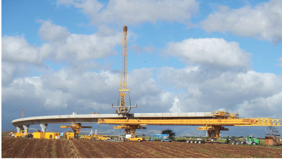
First 110 spans completed in the East Kapolei section of the project were built using the span-by-span erection method with a deck-mounted crane.

As of April 2015, the precast yard was using at least 13 casting cells, which are being turned every day. The concrete mixture proportions allow for stripping of the forms every day to cycle the segments as quickly as