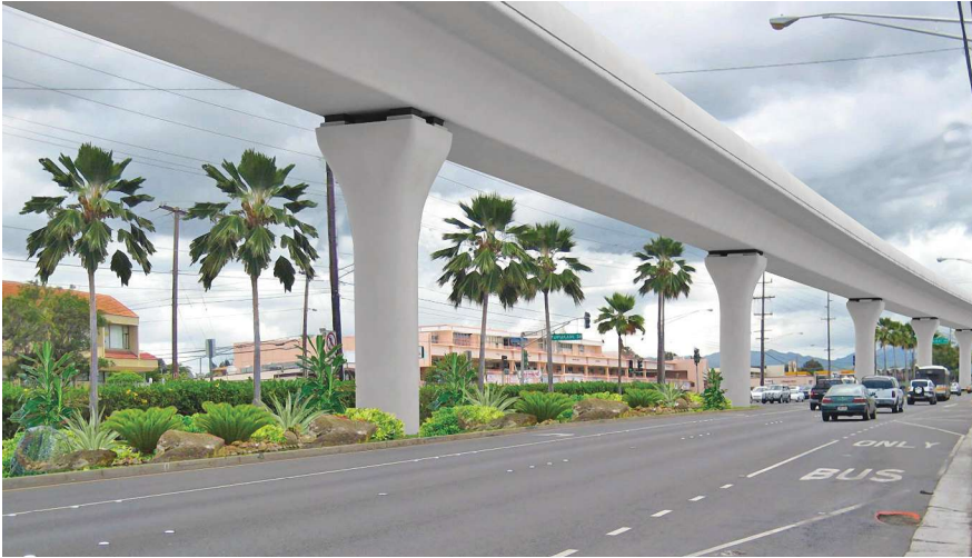
Rendering of typical urban section of Honolulu Rail Transit Project (Segments 1 and 2). All Renderings and Photos: FIGG.

The Honolulu Rail Transit Project is a 20-mile elevated rail line on the island of O'ahu that will connect west O'ahu with downtown Honolulu and the Ala Moana Center via the Honolulu International Airport. The system features state-of-the-art, electric, steel-wheel trains that will travel the entire route through 21 stations in 42 minutes. Trains will travel on steel rails and will be powered by a third rail. The $5.16 billion project will provide approximately 10,000 direct and indirect jobs per year.