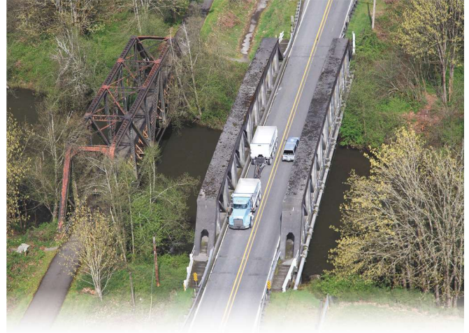
State Route 162/6 existing historical concrete pony truss bridge that was replaced.