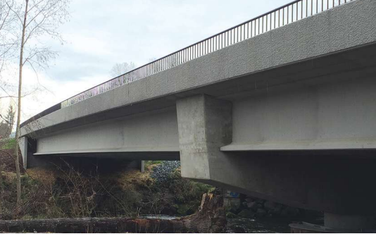
State Route 162/6 Puyallup River Bridge with prestressed lightweight concrete girders (Portion of span 1 and all of span 2 shown).

days. In general, the longer the span, the bigger the camber values. Span 2 is of most importance for this structure because it controls the total depth of concrete to be placed above the girder flange in order to achieve the final profile. The lower and upper camber values for the majority of the span 2 girders were given in the contract plans as 3.44 and 7.88 in., respectively.