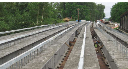
Prestressed lightweight concrete girders were used for the new bridge.

Reduced girder weight for a given span length also has the advantage of requiring smaller crane and hauling