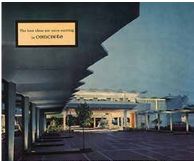
The National Limited Drive Withdrawal Division of Republic National Bank, 10000 N. Central Expressway, Dallas, Texas