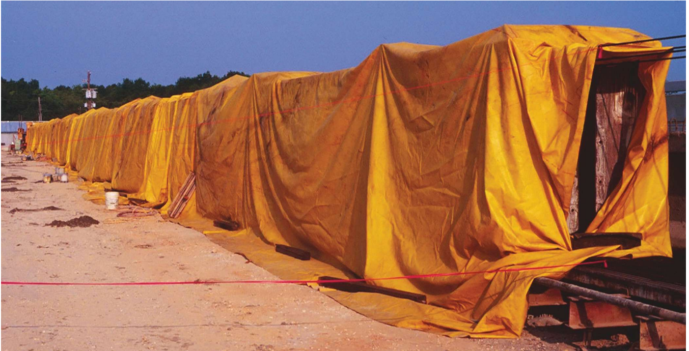
Steam curing of precast, prestressed concrete beams.