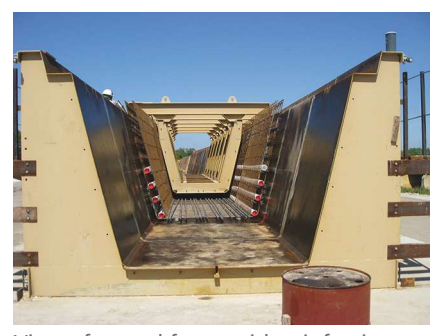
View of curved forms with reinforcing steel and core form in place.