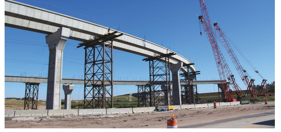
View of erected Ramp I girders spanning above Ramp H.

The post-tensioning is made up of three types of tendons. Each segment has either four-strand flat ducts or 12-strand round polyethylene ducts in the bottom flange depending on girder segment length/location and are used to enable the section to carry its self-weight. The U-girder section also has four draped continuity tendons (each consisting of 15 strands with 19-strand anchors) running through each girder web from beginning to end of the unit. The continuity tendons stitch all the girder segments together and the profiles along the girder lines are designed to keep the stresses (Service III tension and Service I compression) within allowable limits during all stages of construction and during service. The precast concrete U-girder top flange