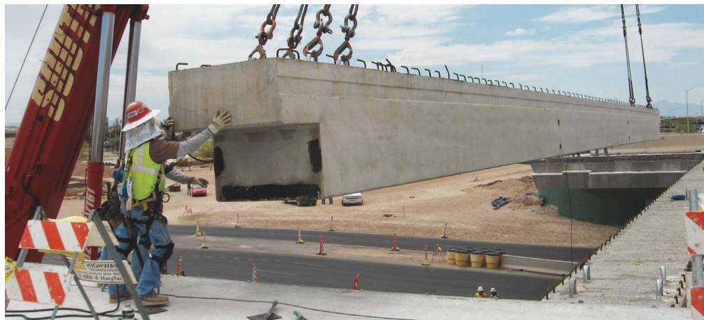
Erection of drop-in girder to complete main span. Note dapped end of girder.

post-tensioned box girders and drop-in precast, prestressed concrete box girders of both standard and custom shapes. The CIP post-tensioned box girders, built on soffit fill and ranging from a depth of 9 ft 6 in. at piers to 4 ft 6 in. at abutments and cantilever end/hinge locations, make up the 80-ft back spans and 44-ft front cantilevers. The CIP box is comprised of an 8 in. top deck, a 6 in. bottom slab, and six webs that were each 1 ft thick. The total