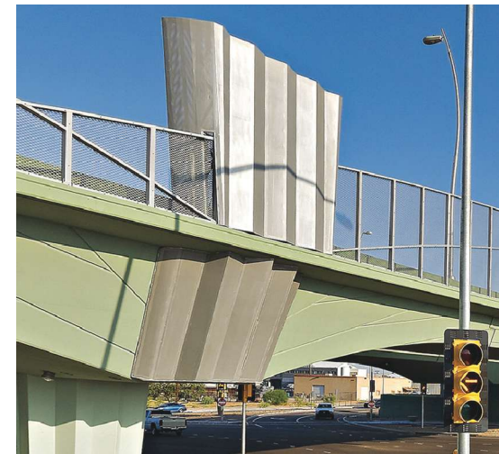
Close-up of bridge with fluted piers and art elements along with architectural enhancements in hardscape and superstructure.

the design. The project team relied on the unique collaboration of the bridge architect with the project.