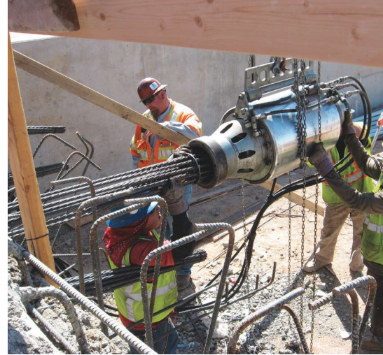
Stressing a post-tensioning tendon in the cast-in-place box.

These led to the creative structural design and construction methodologies described. This unique structural system combination and its construction phasing allowed 22nd Street to remain open to traffic during the construction of the bridge. In the end, the structural design met the challenging SPUI requirements for a large clear span and minimal structure depth over the traffic