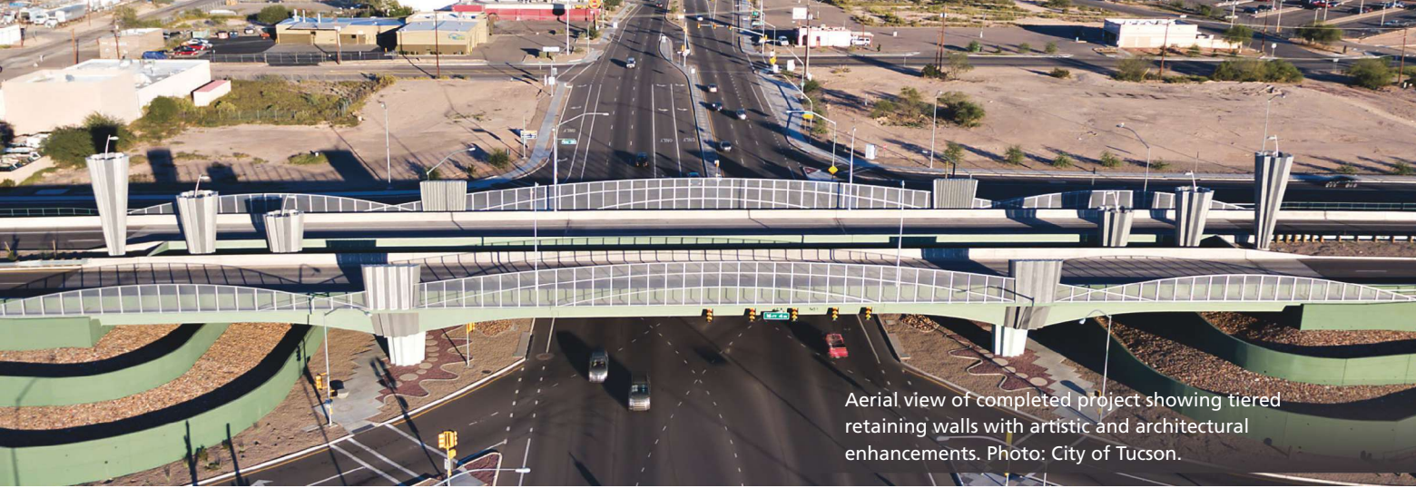
Aerial view of completed project showing tiered retaining walls with artistic and architectural enhancements.