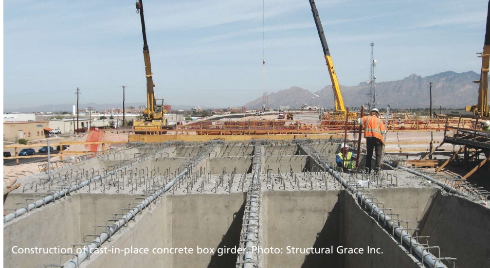
Construction of cast-in-place concrete box girder.

The culmination of these criteria and collaboration of the bridge architect and project artist with bridge designers resulted in the twin 344-ft three-span structures that carry the Kino Parkway Overpass at 22nd Street. Each of the twin bridges is 42 ft 8 in. wide with two lanes each to accommodate projected traffic volumes. These unique structures are a combination of cast-in-place (CIP)