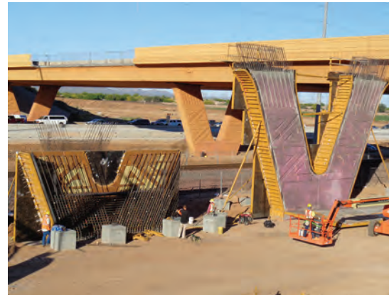
Construction of new Y-shaped columns at pier 3 with existing bridge pier 2 in the background.

The widening of the Estrella Underpass at Grand Avenue bridge demonstrated