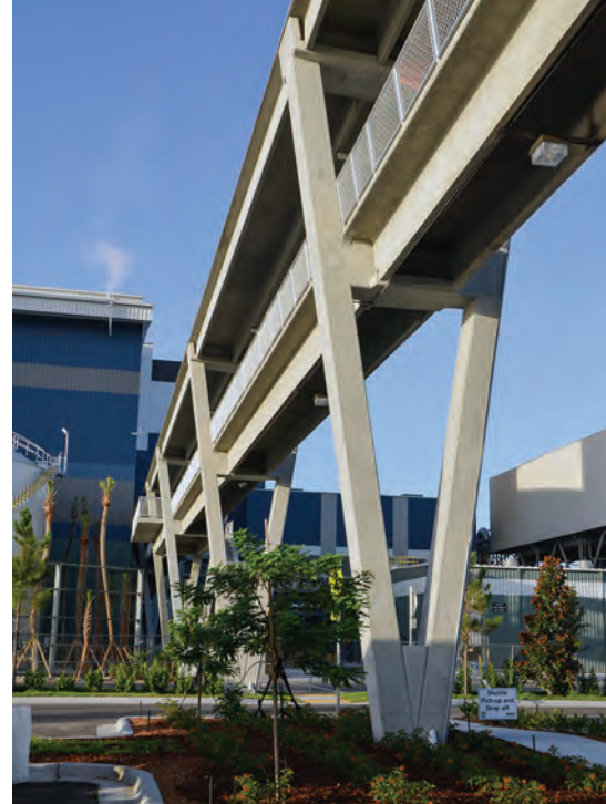
The V-shaped piers supporting the deck and roof open up to the sky while meeting height requirements and site limitations.

Precast concrete stairs shown during construction will provide egress at the viewing platform.