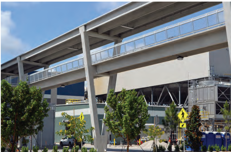
Notched double tees are supported by haunches integral to the cross beams of the V-shaped piers.

connections at either end of the Skybridge had to be retrofitted due to variations in finished floor levels. Minor modifications to the waste-to-energy facility resulted in elevation differences between the staging platform and the power block elevator. The staging platform had to be designed to be supported on the Skybridge foundations while accounting for the high movement of the Skybridge relative to the power-block structure, thus creating a wide pedestrian expansion joint. The 2-in.-wide expansion joint with a cover was designed to account for the relative displacement between the Skybridge and the power-block elevator shaft.