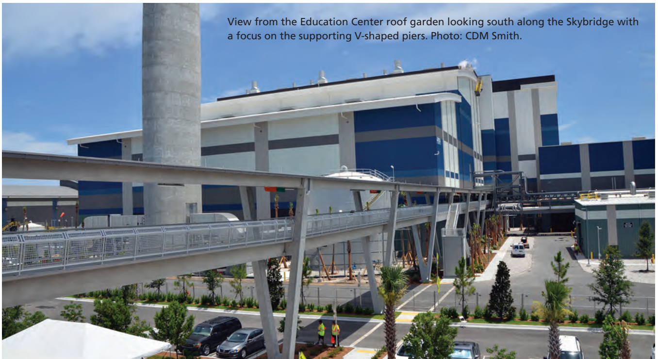
View from the Education Center roof garden looking south along the Skybridge with a focus on the supporting V-shaped piers.

The superstructure primarily consists of precast concrete double-tee roof and