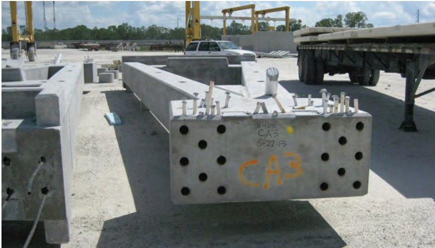
Base of precast concrete V-shaped pier showing splice sleeves with ports for grouting.

period of time in which the crane could be used for superstructure installation. This aggressive installation occurred approximately six months after piling placement.