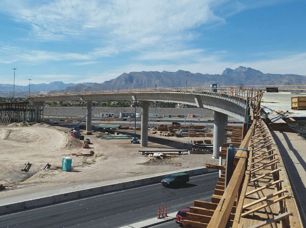
Flyover constructed using post-tensioned, cast-in-place concrete box girders as part of the Centennial Bowl in Las Vegas, Nev.

to develop and administer the design-build contract to construct the new interchange. Original concepts included a steel structure that sloped significantly to match the grade and extensive mechanically stabilized earth walls along the alignment. The contractor proposed