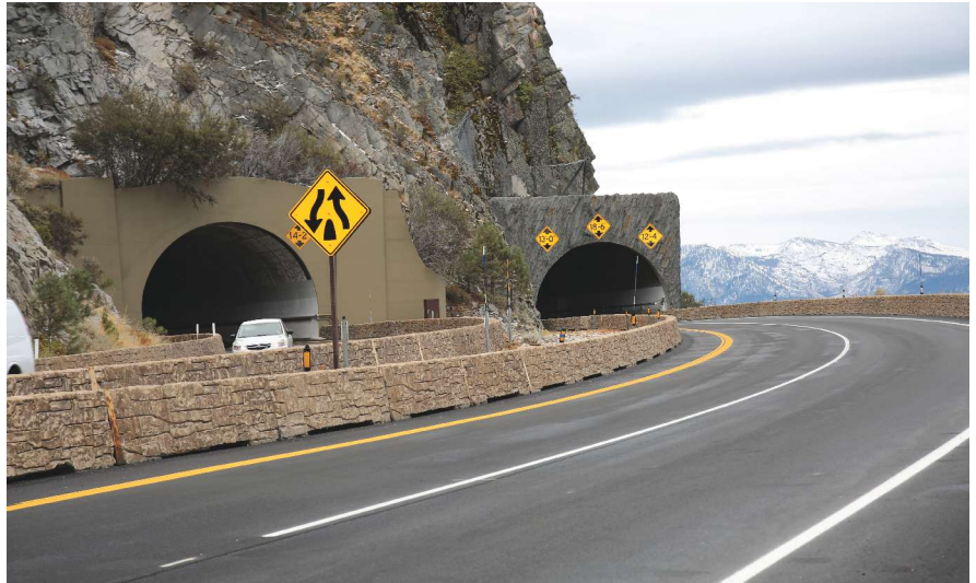
US 50 Cave Rock Tunnel extension for rockfall protection.

In the past, precast concrete girders had limited use throughout the state. Records indicate the occasional construction of precast concrete box-beam and girder bridges dating back to the 1930s, with the highest concentration in the 1960s. Only in the last 10