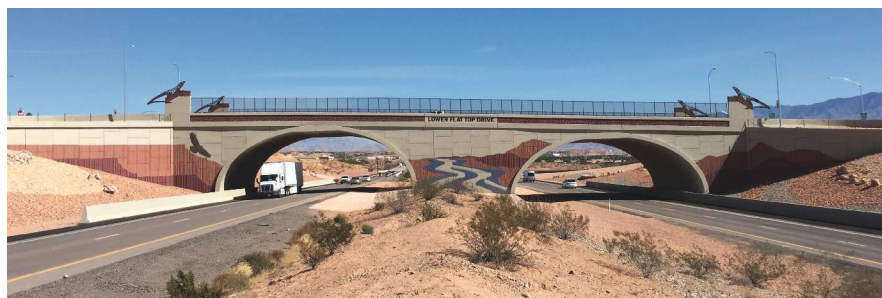
Interstate 15 Mesquite interchange constructed using precast concrete arches.

The newly constructed Interstate 15 Mesquite interchange is another notable example of the use of precast concrete arches. The city of Mesquite, Nev., and NDOT worked together