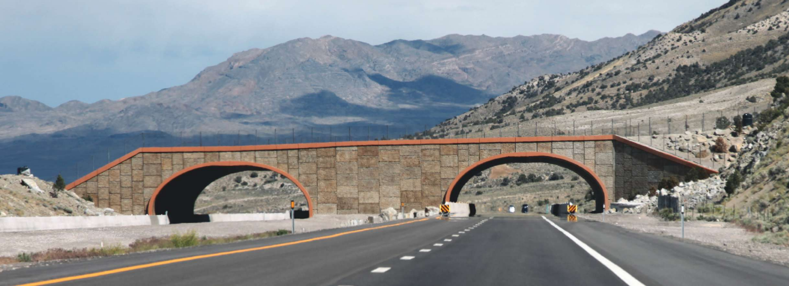
Interstate 80 Silver Zone Summit wildlife crossing.

of the states with larger construction programs, NDOT typically constructs fewer than a dozen bridges statewide per year.