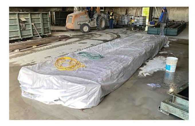
Figure 3. Fabrication of ultra-high-performance concrete (UHPC) ribbed panels.