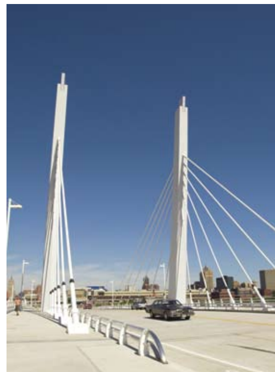
Sixth Street Viaduct, Milwaukee

'Post-tensioned construction offers unique opportunities to increase the span range we can achieve.'