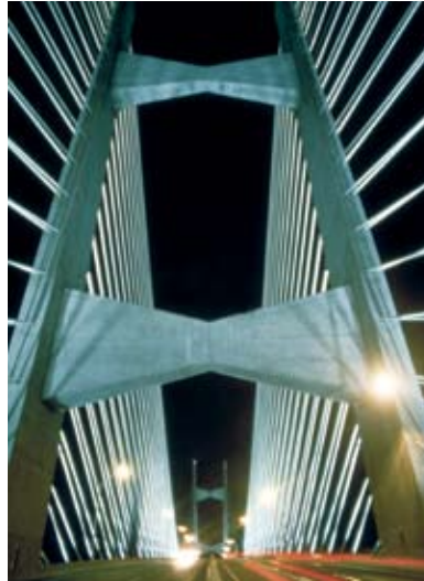
Concrete bow-tie strut used with cable-stayed bridges aligns form and function.