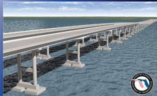
I-10 Escambia Bay Bridge Pensacola, Florida

Bridges for the 21st Century www.pbworld.com