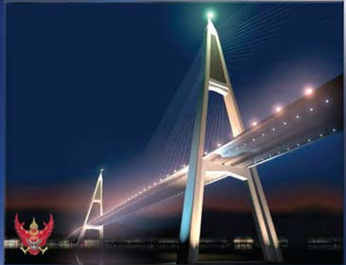
SOBRR Chao Phraya River Bridge Bangkok, Thailand