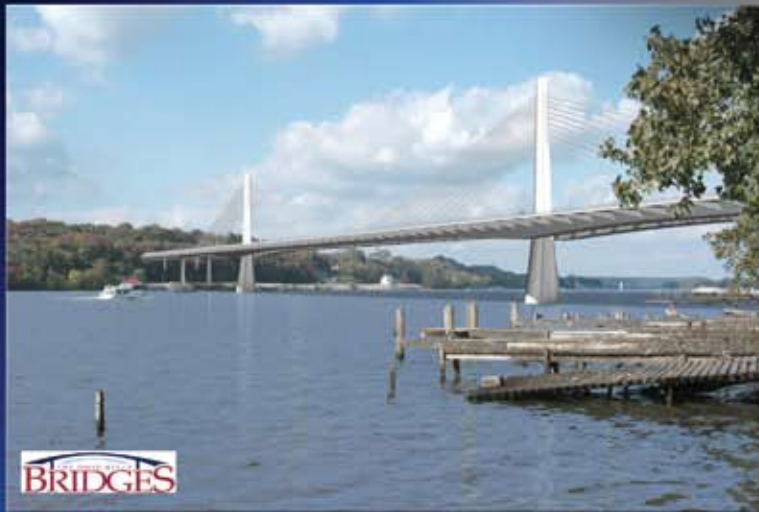
East End Bridge Louisville, Kentucky