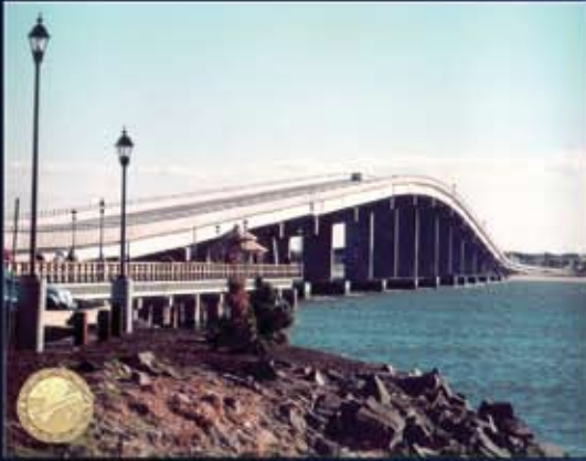
Ocean City - Longport Bridge Cape May, New Jersey