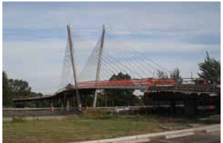
Delta Ponds Pedestrian Bridge currently under construction for City of Eugene, Ore.