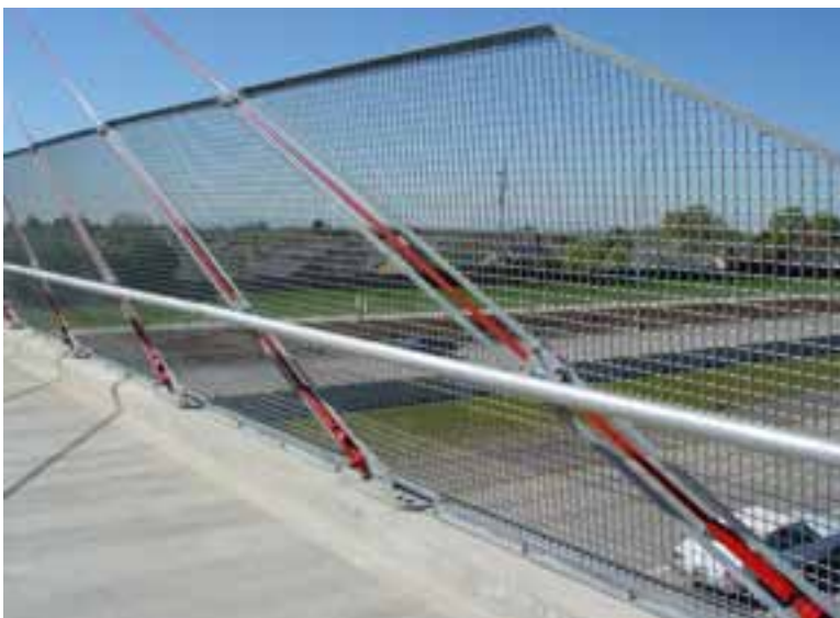
Detail of stay connection to deck and integration of rail and fencing.