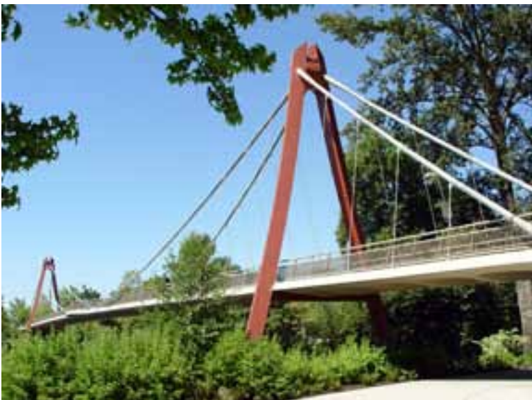
DeFazio (Willamette River) pedestrian bridge.