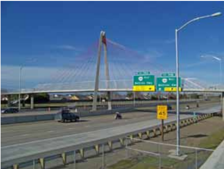
Elevation view of pedestrian bridge over I-5.