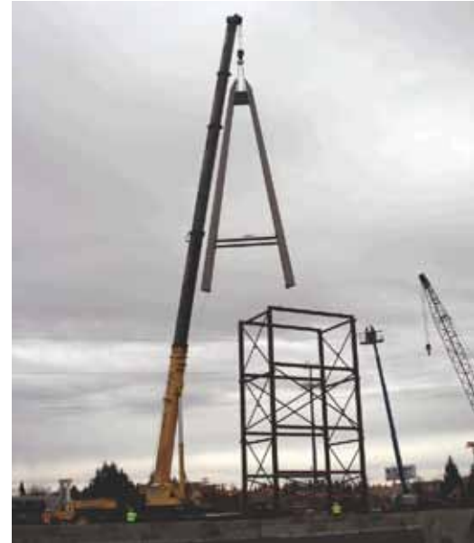
Precast concrete tower at high point during erection.