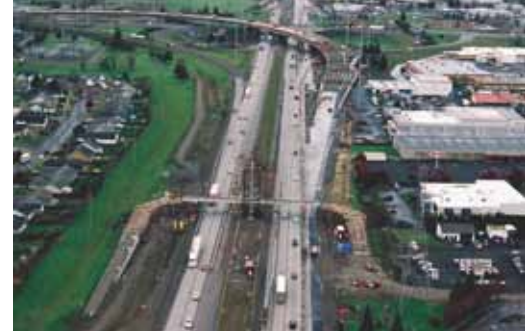
Location of the pedestrian bridge in context of the Beltline Interchange Improvement Project.

The deck reinforcement and full-length deck post-tensioning were installed after final grading of the panels by adjusting the stay cables to their calculated length prior to adding the remaining dead load. The next step of construction was casting the concrete topping slab within the post-tensioned portion of the bridge, post-tension the deck, and then cast the remainder of the approach spans, spiral stairway, and appurtenances. Finally, the protective fencing and railings were installed to complete the bridge.