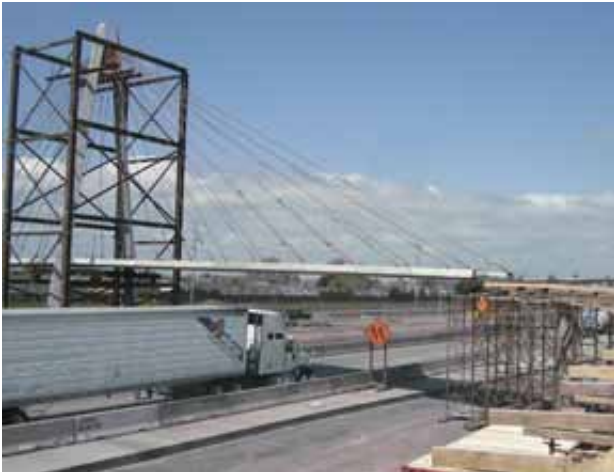
Daytime traffic under balanced cantilever main spans.