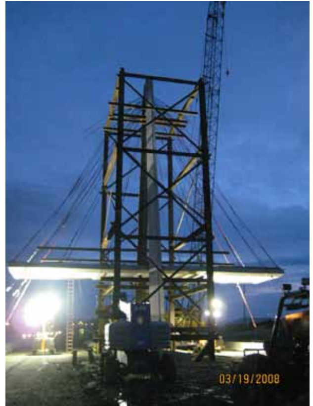
The nighttime erection of precast concrete deck panels.