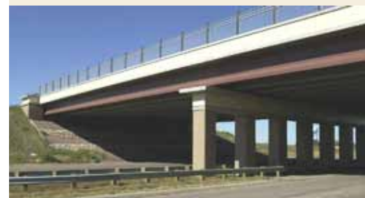
The inspiration for articulation and coloring of the concrete elements of this two-span bridge, First Street over I-29 near Sergeant Bluff, came from nearby examples of Prairie School architecture.

UHPC precast waffle deck panel bridge to be built in Wapello County