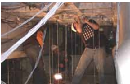
Precast UHPC waffle slab deck panels passed the testing program shown here at Iowa State University and are part of the design for a Wapello County bridge to be constructed in 2010.

Concrete bridges are a mainstay on the Iowa highway system and will continue to improve with research, advancing concrete technology, and aesthetic enhancements.