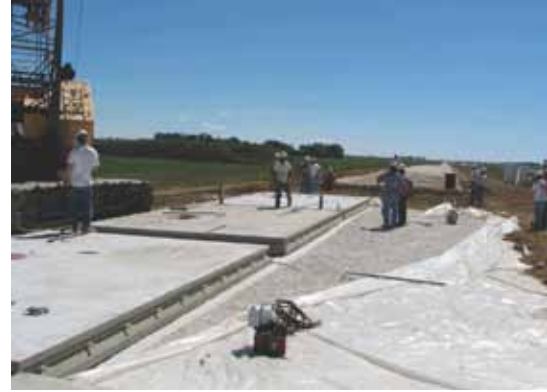
In O'Brien County, near Shelton, precast paving approach panels were installed on both ends of a new highway bridge to demonstrate rapid construction while eliminating settlement at the abutments. Each section was approximately 77 ft long and 28 ft wide.

The first was a single-span, 110 ft long by 27 ft wide, Wapello County bridge (Mars Hill Bridge) with a cross section that consisted of three bulb-tee girders designed with concrete compressive strength of 24,000 psi and an allowable tensile stress at service of 600 psi. A typical UHPC mixture utilizes steel fibers in lieu of conventional shear reinforcing bars and has compressive strength that generally ranges from 16,000 psi to 30,000 psi. The tensile strength, usually neglected in concrete, can be as high as 1700 psi. The second bridge (Jakway Park Bridge) utilized a unique pi-shaped girder superstructure and was built by Buchanan County in 2008. In 2010, a third bridge with a UHPC waffle-shaped deck panel system will be built in Wapello County. It will also use field-placed UHPC to connect panels to panels and panels to girders. More details on the Wapello and Buchanan County bridges are given in