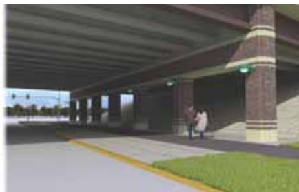
Renderings of I-29 mainline bridges over local streets in Sioux City, projected for construction in 2014.