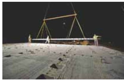
Full-width deck panel placement at the 24th Street project site in Council Bluffs, the first Highways for LIFE project in Iowa.