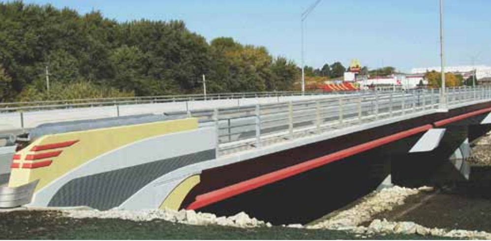
An illustration of community gateway enhancement of a three-span, precast, prestressed bulb-tee beam bridge in Algona, Iowa, is U.S. 169 over the East Fork of the Des Moines River. The sculpted concrete aesthetic features capitalize on the city's railroad heritage.

orchestrated to design a project that strongly reflects aspects of its unique context.