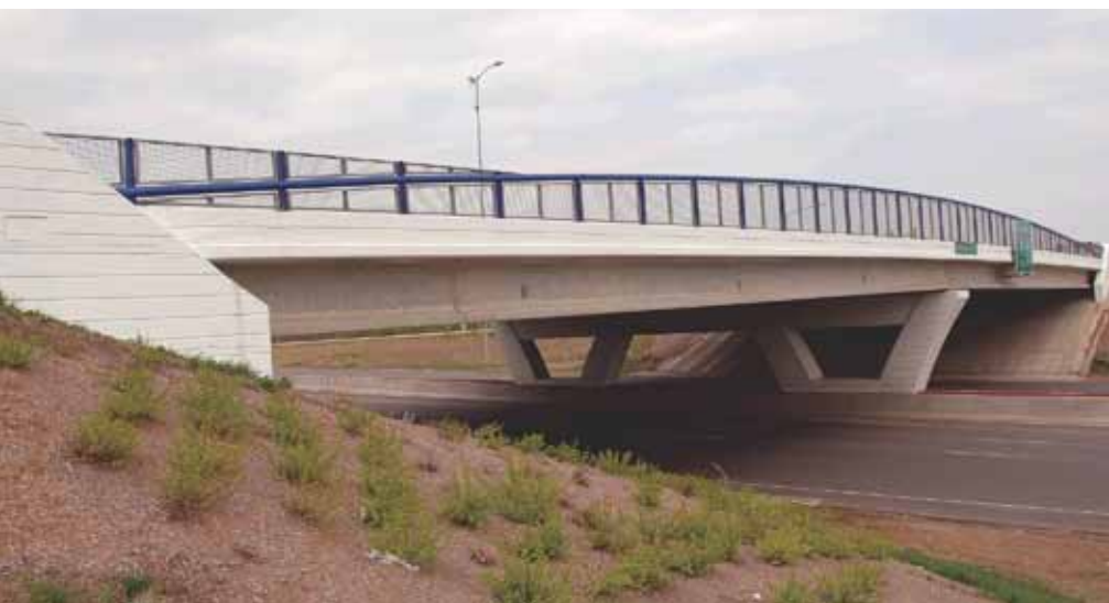
The new standard bulb-tee beams were installed in many bridges over I-235 in Des Moines.

In recent years, the IowaDOT has become more responsive to the concerns of citizens about the appearance of state infrastructure projects. Bridges have become a prime focus of aesthetic enhancement efforts, especially when projects are built in and near communities. Routine structures are often considered by local municipalities to be community gateways, and the IowaDOT has tailored enhancement schemes to address these subjective project parameters. Occasionally, these aesthetic solutions become customized expressions of the communities in which they are situated. Instead of using an enhancement cookbook of ready design features, each effort has been uniquely