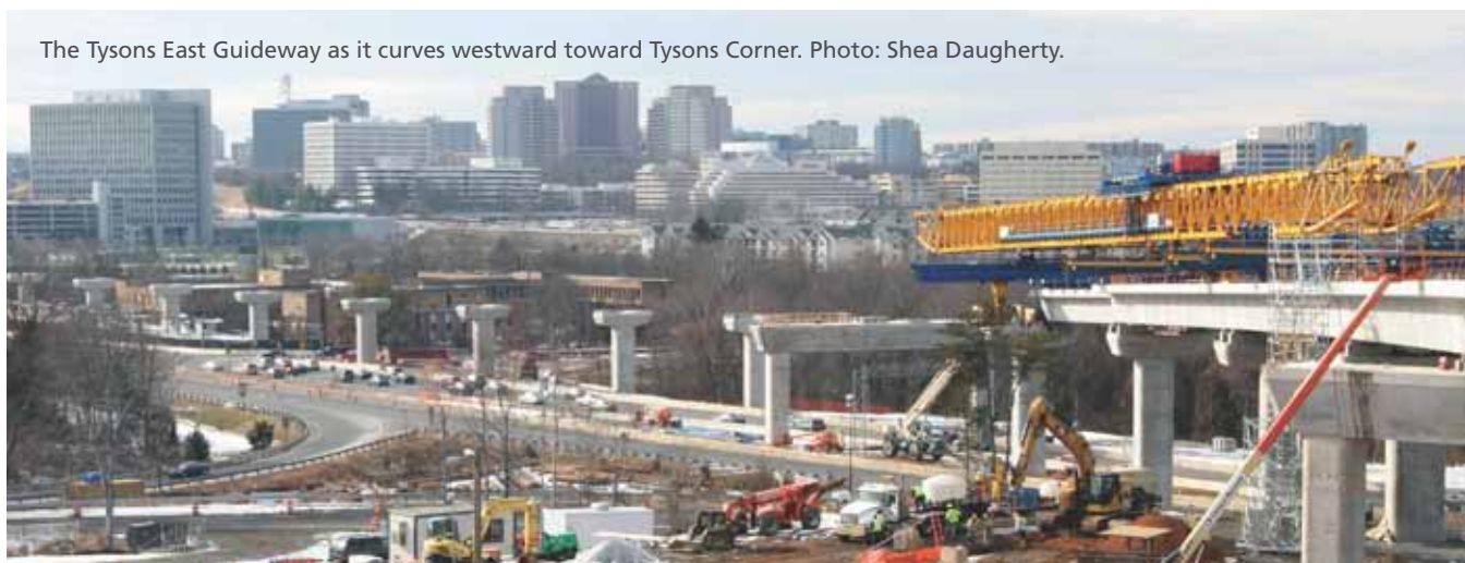
The Tysons East Guideway as it curves westward toward Tysons Corner.

Concrete maturity meters were used for the in-place strength of the cast-in-place substructure concrete where post tensioning was not required. This enabled the aerial crews to strip both column and pier cap formwork systems earlier and reuse them elsewhere. The client approved the use of these meters for stripping formwork, but not for verification of strength prior to post-tensioning. Curing compound was used on fresh concrete when the formwork was stripped before 7 days or less than 70% of the design strength was achieved.