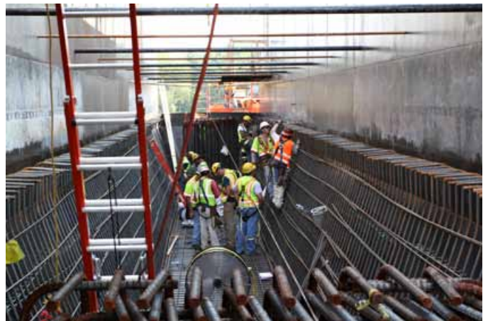
Ironworkers are shown installing the reinforcement inside a straddle bent form.