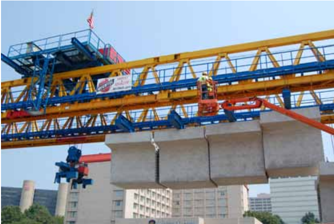
In a typical sequence, segments are lifted into place, aligned and post-tensioned on the Tysons West Guideway.