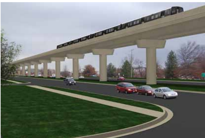
A rendering of the Tysons West Guideway in the median of Route 7 in northern Virginia. Rendering: Dulles Corridor Metrorail Project.