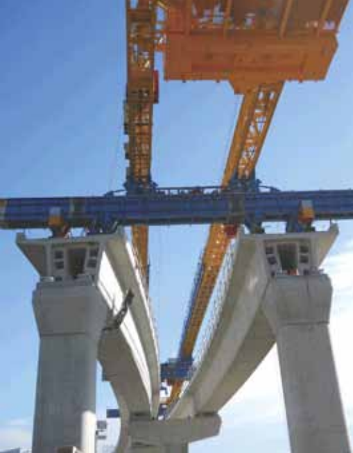
A completed span in a span-by-span construction area showing the cross section of the guideway girder.

typical guideway sections. The boxes change to 7 ft wide by 5 ft deep with a 16-ft-wide top flange through the stations, where the spans are about 50% shorter. Guideway spans have slightly thinner webs and slabs at 9 in. thick, while station segment webs and slabs are 10 in. thick.