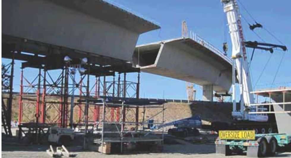
Cantilever construction shown adjacent to an end span. End span segments were supported on shoring designed to support 100 kips per leg.

Segments were produced using the long-line casting method. This involved beginning at the pier segment and match casting segments toward the middle of the span. Concrete slabs were constructed on which to cast the segments. These slabs defined the profile geometry. A polyethylene sheet and plywood on top of the slab provided a slip plane to separate segments prior to erection. The movable formwork was bolted to the slab at each segment joint. The long-line casting method allowed the segments to be cast and stored in one place and eliminated the need for large handling equipment in the casting