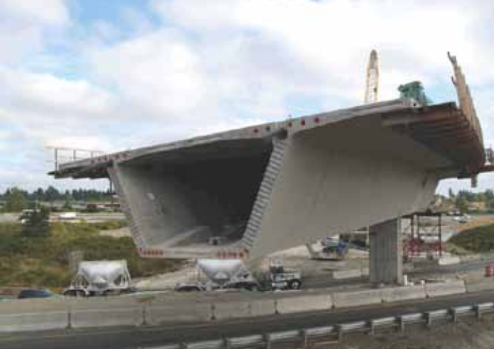
A partially erected cantilever shows the cross section and cantilever post-tensioning.