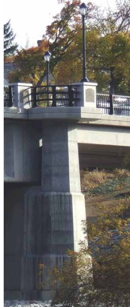
The Cross Street Bridge incorporates several aesthetic enhancements such as stepped, hexagonal, wall piers with vertical recesses, pedestrian overlooks on each pier end, anodized bridge railings, and decorative street lighting.

For more information on this or other projects, visit www.aspirebridge.org .