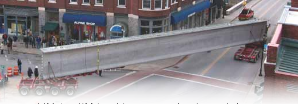
A 10-ft-deep, 110-ft-long girder segment negotiates city streets in downtown Middlebury.

The west abutment consists of a pile cap stub abutment on a single row of H-piles enclosed by a wrap-around mechanically stabilized earth (MSE) wall. The east abutment is a traditional abutment stem supported by a spread footing. Each of the piers is wall-type and is supported by spread footings on H-piles.