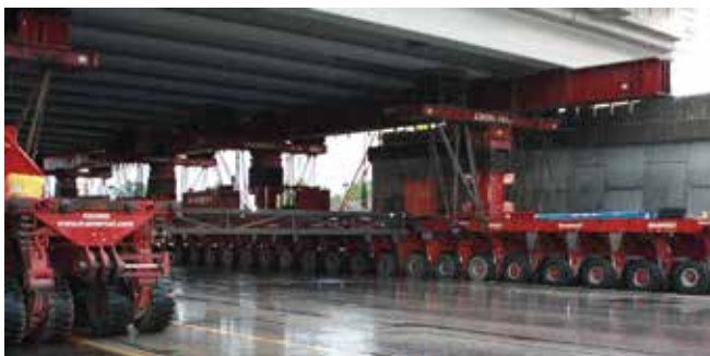
Both spans of the Rawson Avenue Bridge were placed during a 12-hour overnight closure of the expressway.

path, ensuring a smooth ride. This included determining the allowable soil loads and specifying ground improvements due to undesirable soils or loading conditions. Proof rolling was performed throughout the travel path, with underperforming areas undercut and backfilled with compacted fill. Steel plates were placed along the travel path to the interstate roadway.