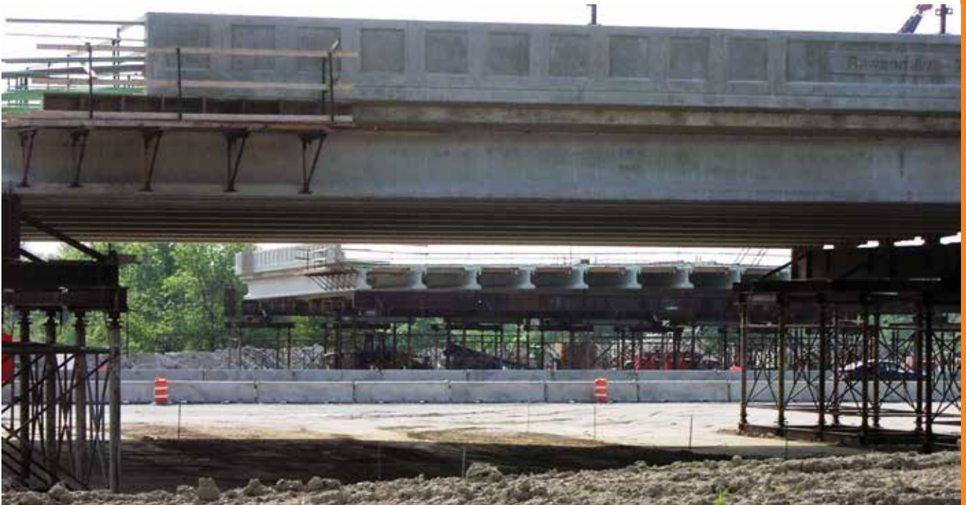
For the Rawson Avenue Bridge projects, the two spans were constructed on opposite sides of the expressway.

Constructing bridges off line and moving them into place offers key benefits to owners and contractors. As a result, more bridges are being designed and built using these techniques. This article is part of a series looking at some of the key considerations when using accelerated bridge construction (ABC) approaches to construct bridges. It describes the use of self-propelled modular transporters (SPMTs), which are becoming more popular with owners, designers, and contractors as they understand the concepts and see the advantages of ABC.