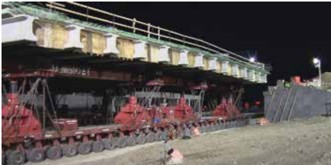
The first span of the Rawson Avenue Bridge is moved into its final location.