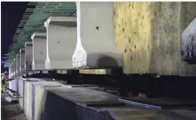
The relative elevations and spacings of the beams in the bridge built in the staging area must match those of the final location.

Two new 143-ft-long concrete bridge spans were built alongside I-4 instead of over the interstate, reducing the need for road closures and traffic disruptions. Weighing nearly 1300 tons, the new spans were moved into place with SPMTs. Using this approach saved about four months of closure time, greatly reducing impact to drivers. Traffic needed to be detoured for only two weekend nights, using rolling roadblocks.