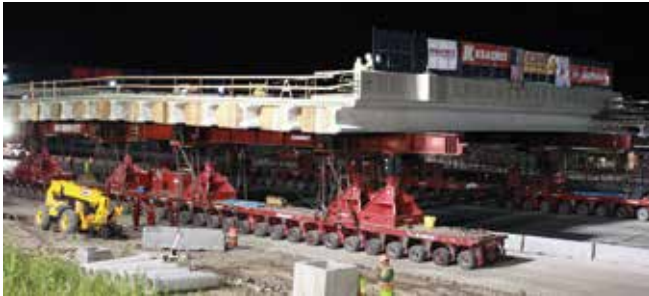
Self-propelled modular transporters move the first span of the Rawson Avenue Bridge from its staging area to the bridge location.

The first bridge constructed in the United States using SPMTs was completed in Volusia County, Fla., in January 2006. The Florida Department of Transportation's construction team used SPMTs to replace a bridge over an interstate highway. During this project, the existing Graves Avenue Bridge was lifted and moved to the side of Interstate 4 (I-4) in only 22 minutes using SPMTs.