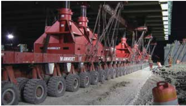
Six self-propelled modular transporters in each line were used to move the Rawson Avenue Bridge.

Crews worked together to provide the necessary site-specific subgrade demands in the bridge staging areas and travel