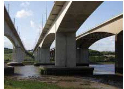
On the left, the Channel Tunnel rail link viaduct crossing the the Medway River in the UK.