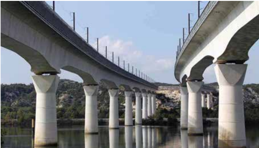
Twin 1000-m-long (3280-ft), high-speed railway, viaducts crossing the Rhone River near Avignon (France).

ft) spans to cross the Rhone River. Similarly, the Medway River crossing in the U.K. necessitated a bridge having a 152-m-long (499-ft) span for the Channel Tunnel rail link (CTRL) between Paris and London.