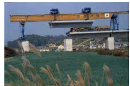
Full-span construction technique showing placing a precast concrete box unit.

construction when span lengths were not compatible with incremental launching capabilities. Balanced cantilever and incremental launching were also combined when other exceptional construction techniques, such as rotation, had to be used to cross existing motorways with as little traffic disturbance as possible.