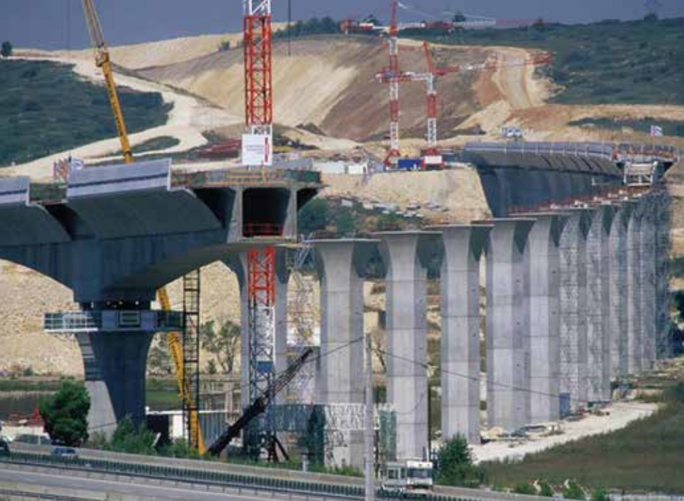
Balanced cantilevers of the main bridge of the Ventabren Viaduct to be rotated across one of the most congested motorways in France.