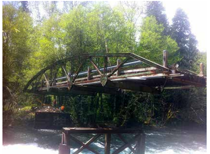
Crews remove the original truss bridge that had served island residents for more than 40 years. It was built after winter flood waters washed away the previous bridge in December 1964.