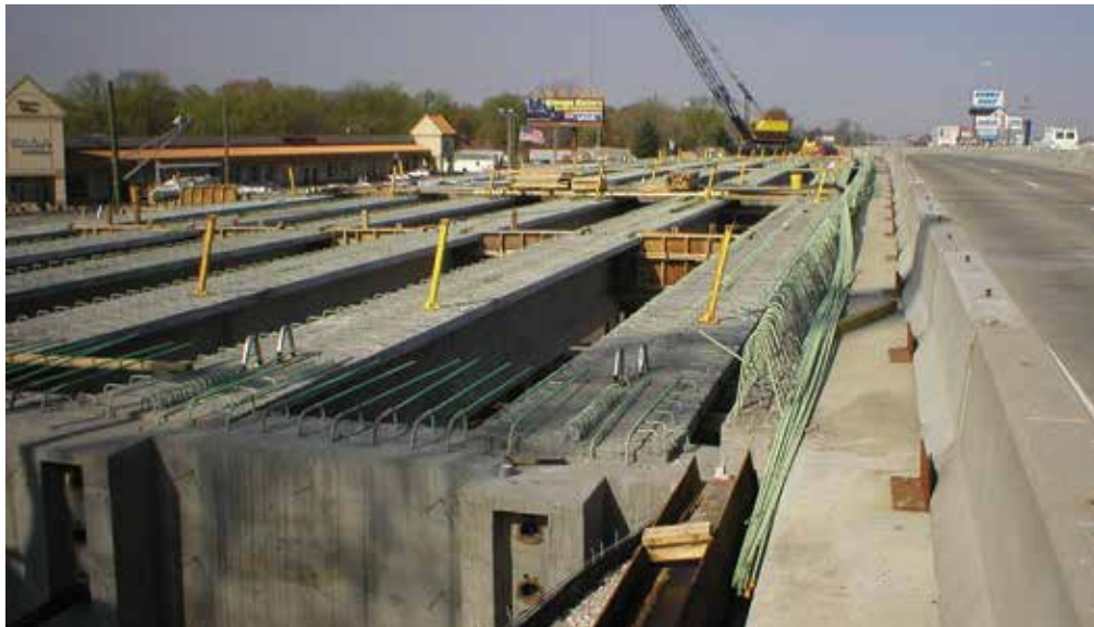
The construction of the State Route 66 Bridge over Green River Road was phased to maintain two lanes of traffic in each direction.

13-span design to a 10-span structure without changing the roadway profile. "That impressed DOT officials, and we worked our way up the interstate corridor from there," says McCool.