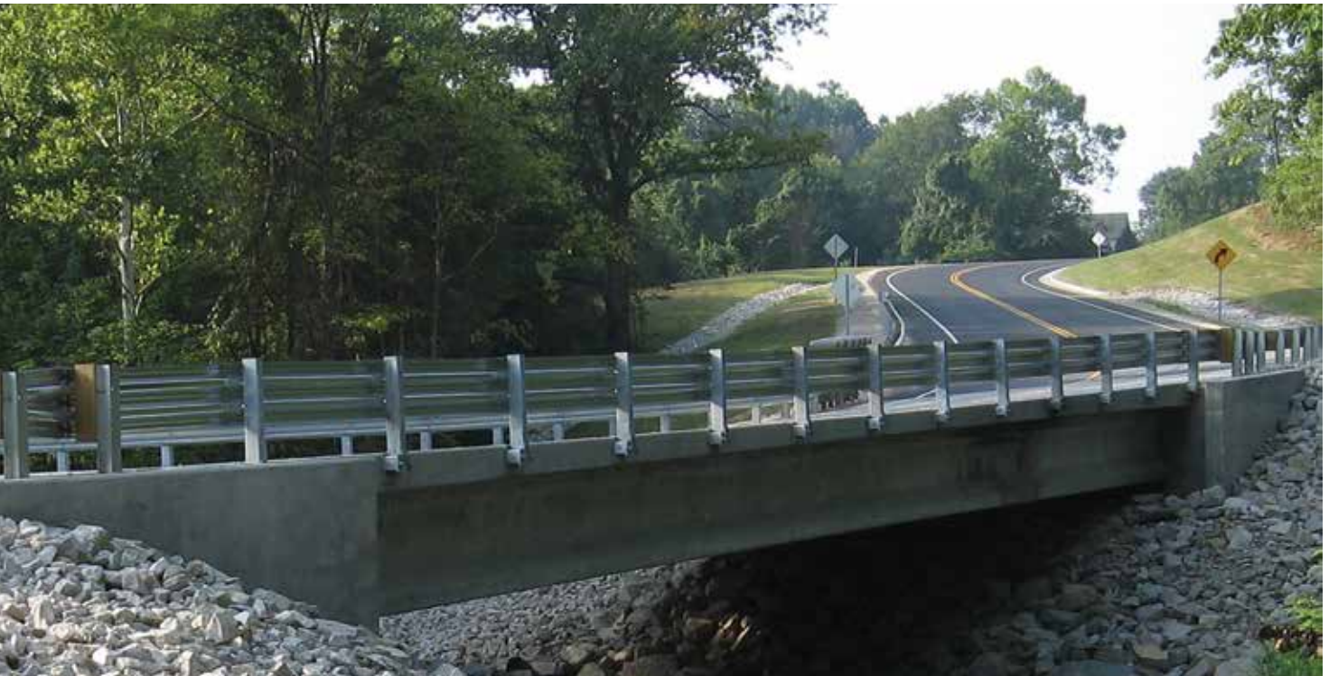
The replacement Rockport Road Bridge over Clear Creek in Monroe County, Ind., is a single-span, prestressed concrete I-beam bridge with integral end bents and a concrete deck.

The project was a state finalist in the Engineering Excellence Competition of