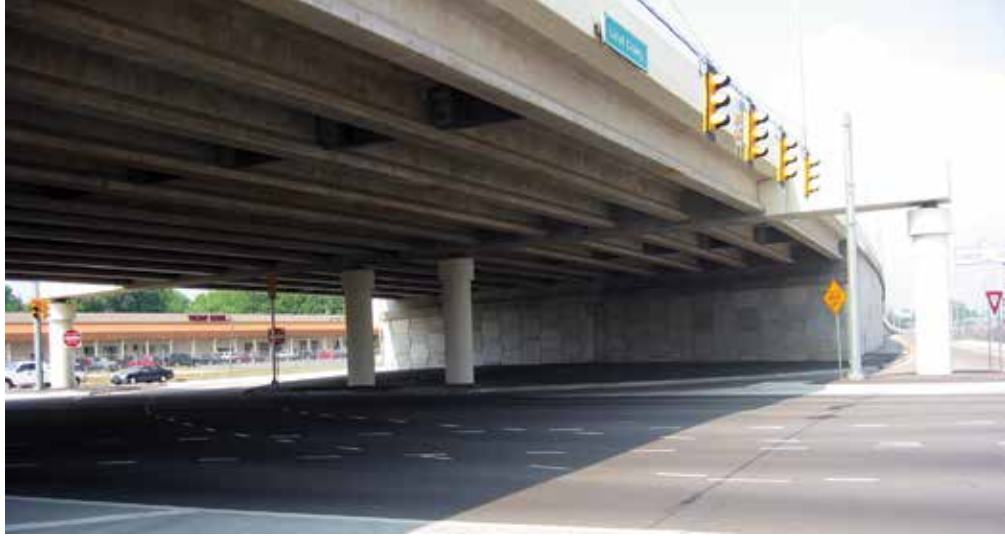
Designed to reduce traffic congestion, the State Route 66 Bridge over Green River Road in Evansville, Ind., replaced a single-span steel bridge with a curved, three-span, post-tensioned concrete bulb-tee design.

The firm started its work on the project by designing two twin bridges on a tight deadline, one of which they were able to reduce from the planned