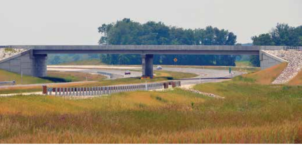
By flipping the original design, Beam, Longest and Neff used Indiana's cost reduction incentive option to eliminate a bridge from the interchange, saving considerable time and money.

by a significant amount, resulting in considerable savings," says James Longest.