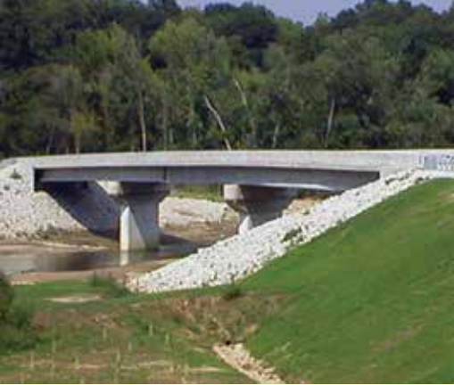
Fountain County Bridge No. 7 in Indiana used Beam, Longest and Neff's bridge design, survey, environmental, and right-of-way services.

bridge deck while under traffic. This resulted in only single-lane closures of the northbound lanes. Some of the acceleration techniques, such as precast concrete approach slabs and joint connections, had not been used before in the state, but the concepts were derived from recent PCI publications.