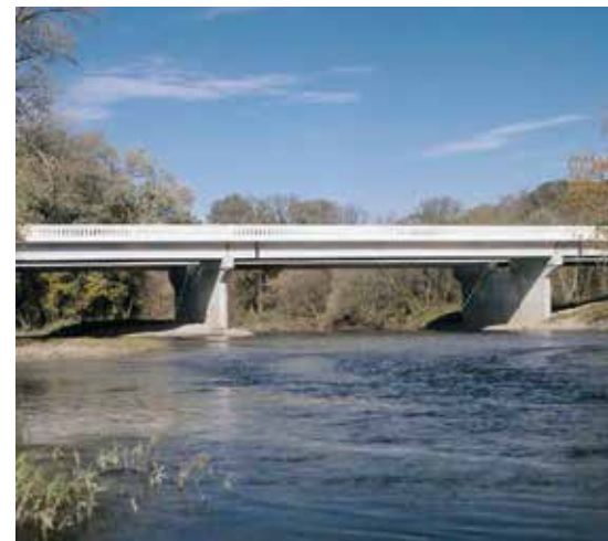
Beam, Longest and Neff provided bridge design and other services for the Hamilton County Bridge No. 230 in Indiana.

For additional photographs or information on this or other projects, visit www.aspirebridge.org and open Current Issue.