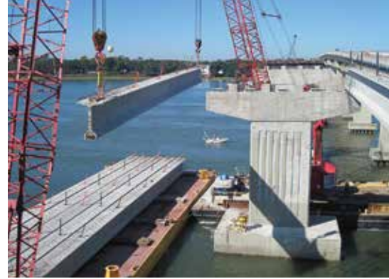
Record-setting, 96-in.-deep main-span; bulb-tee beams being set.

The balancing act presented when considering the strength and ductility to withstand a seismic event in conjunction with a scoured and un-scoured channel bottom condition was examined. In particular, the displacement demands were determined through elastic dynamic (modal) analyses and the substructure displacement capacity was determined through the use of non-linear static (pushover) analyses. And, while vessel impact due to barge trains and small cruise ships was considered separately through a probabilistic hazard design, the strength and ductility implemented to withstand earthquake loading lent itself to the bridge's resistance to vessel impact and other environmental lateral loadings.