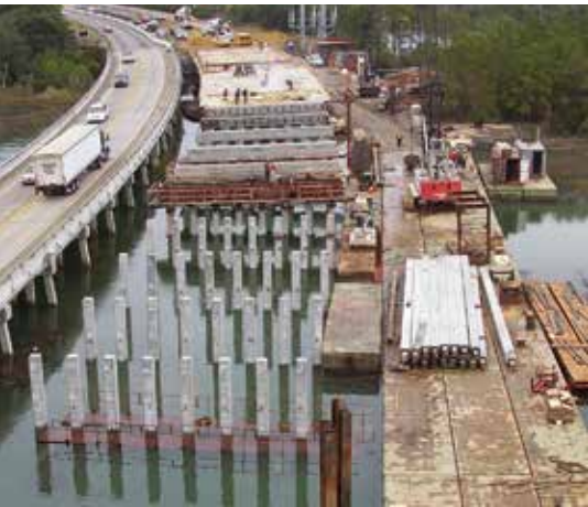
Flat slab bridge section piles and deck slab beginning to take shape from the shore at Lady's Island.