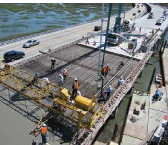
Placing deck concrete for the new structure.

The superstructure design included the use of 96-in.-deep, prestressed concrete bulb-tee girders for the three 170-ft-long main spans over the Intracoastal Waterway. The bridge design team selected prestressed concrete girders to meet the overall project tenets of maintainability for the SCDOT. Reinforced concrete hammerhead piers were used to mimic the overall profile of the existing piers. Whereas pile group foundations were present on the existing structure, drilled shaft construction was used on the new bridge to resist the high lateral demands from seismic, wind, and vessel collision hazards. The hammer head pier stems were also treated with a fluted form liner to improve aesthetics over a plain solid concrete face.